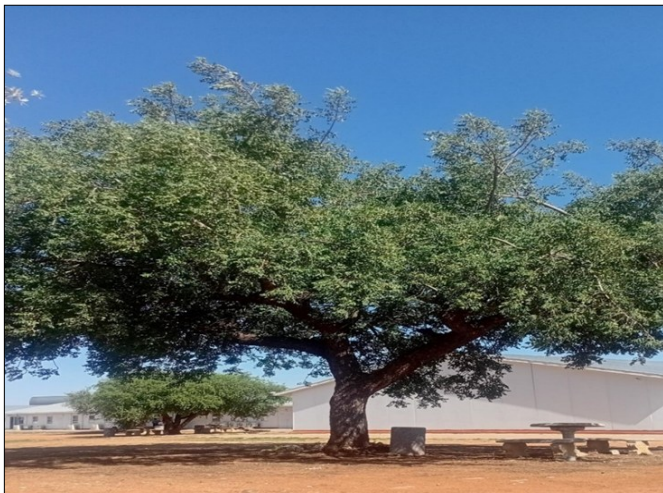
Fig. 1. Mature female Sclerocarya birrea tree.