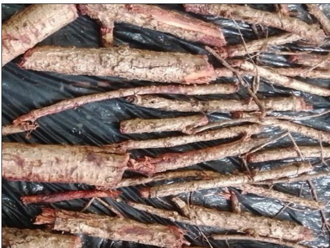
Fig. 5. Marula roots from an excavated site.

Ground penetration radar (GPR) is another method which requires to be run prior to excavation. Ground penetration radar uses electromagnetic pulses, which are transmitted onto a surface and these pulses are reflected to the antenna which operates at a signal frequency of 450 MHz (25). Ground penetration radar obtains information on soil profiling and root architecture for plant root system as a computerised scan image (27). The technique has been applied in archaeology, civil engineering as a detection