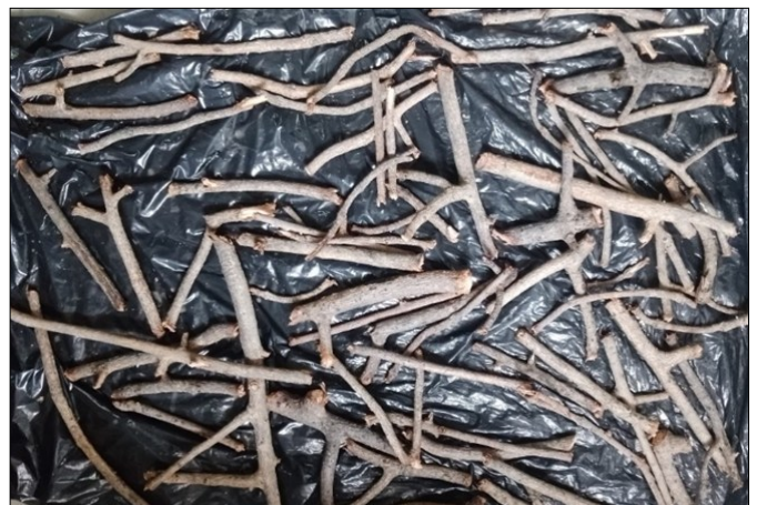
Fig. 6. Twig samples collected from Sclerocarya birrea tree.

The most widely practised method of sampling twigs and fine branches is through pruning using hand tools like razor blades, pruning saws, pruning knives and pruning shears. Twigs of different sizes can be collected as illustrated in Fig. 6. Alternatively, drones called flying tree top samplers (FTTS) can be used to collect small diameter branches of range 0.8–1.6 cm. However, in dense canopy, it can be difficult for the drone to manoeuvre, set the gripper and the saw blade on position for sample collection (34). Use of hand tools like razor blades, knives and pruning shears remains the widely used twig sampling methods due to less costs. Fig. 6 shows S. birrea twigs sampled using pruning shears during