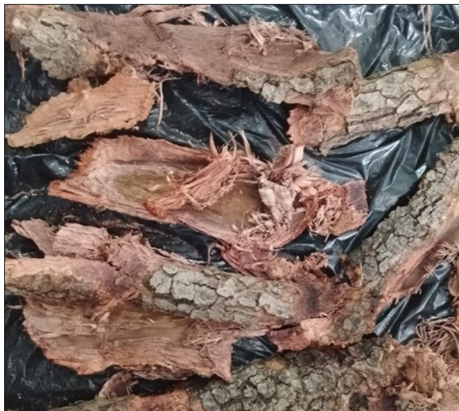
Fig. 3. Bark sample of Sclerocarya birrea .