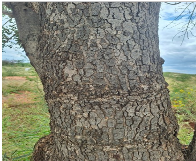
Fig. 2. Mature stem of Sclerocarya birrea .

the after effects of the bark harvesting method (19). Post-harvest recovery and regeneration is affected by such factors like the amount of bark harvested, scar or wound depth, season of harvest, the amount of exudate released during sampling and the plant physiology (20). An investigation of the effect of wound size on the recovery of a plant from partial and total bark removal, showed that partial debarking up to 50 % circumference removal led to quick and successful recovery while 100 % bark removal caused larger wounds which took longer to recover (10). It is recommended to sample bark from a mature S. birrea stem (Fig. 2).