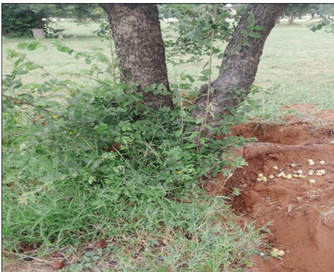
Fig. 4. Excavated site under Sclerocarya birrea tree.

On the other hand, soil coring method is done through forcibly driving a sharp polyvinyl chloride (PVC) or metal pipe of 5 cm diameter, into the ground using a rubber mallet or a powering motor to take out soil with small, fine and fibrous roots from up to 40 cm depth. Course, complex and larger root systems for bigger and mature trees like giant marula can be sampled using excavation (25) (Fig. 5). Coring bulky density soils and rocky soils, would require steel corers and motorised devices even to 1 m soil depths because PVC corers can break (24, 26). Unlike the manual type, the motorised power coring device can cut through rock and larger roots, eliminating biases and challenges associated by compactness and presence of rocks in the soil during sampling (21). Fig. 4 shows excavated site under a marula tree and Fig. 5 shows roots sampled from an excavated site.