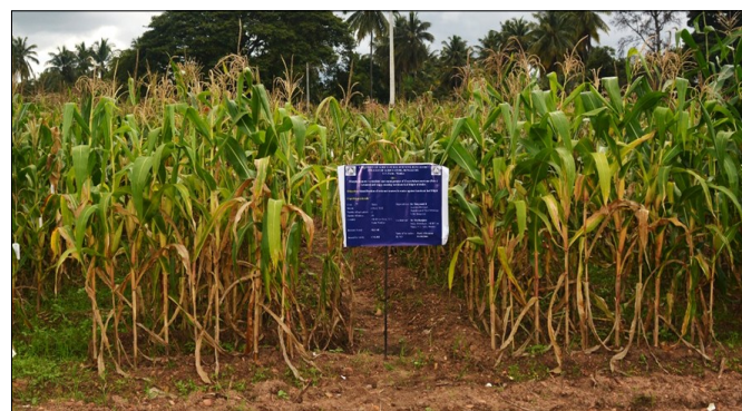
b. Kharif - 2025