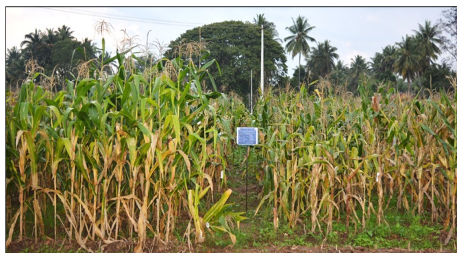
a. Kharif - 2024