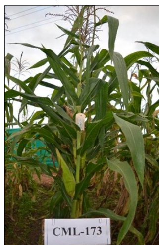
Resistant - CIM-173