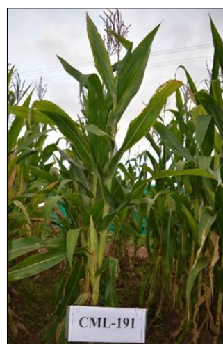
Resistant - CIM-191