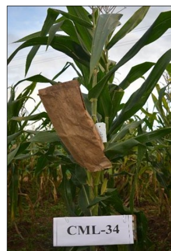
Resistant - CIM-34