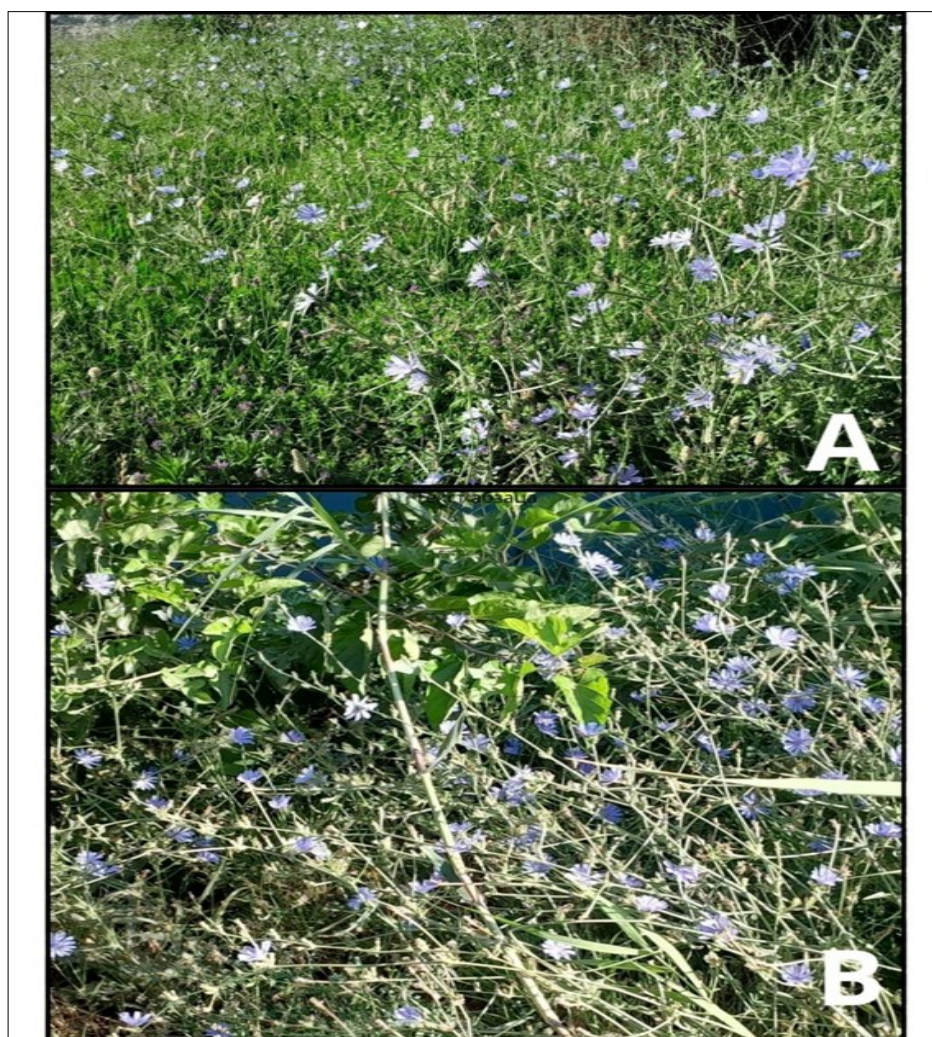
Fig. 3. Distribution in the A) Adir area and B) territory of Tugai.

Khorezm, Bukhara and Navoi provinces (arid climate, sandy and saline soils, precipitation 120-150 mm/year).