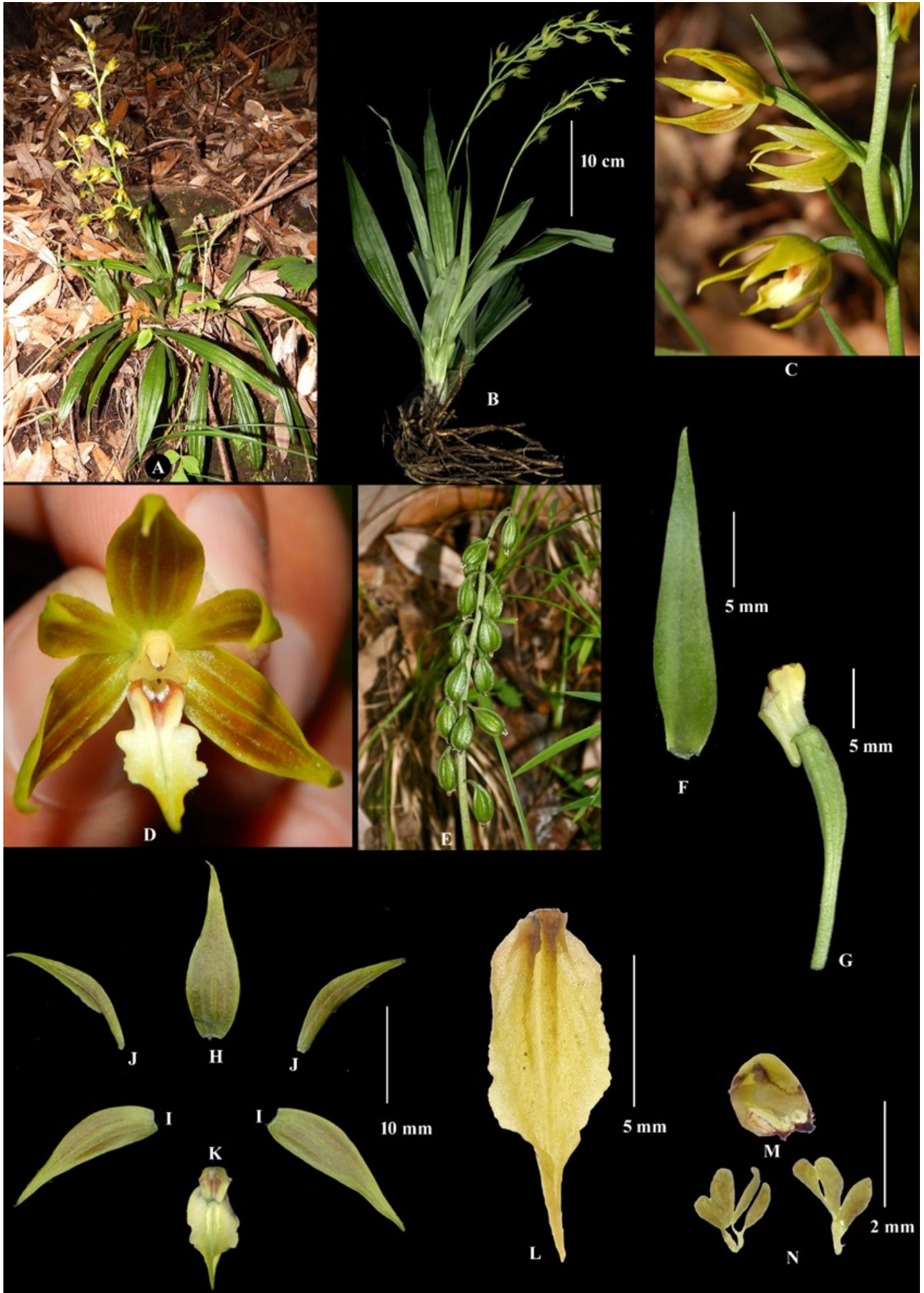
Fig. 1. Calanthe trulliformis King & Pantl.: A&B. habit, C. part of inflorescence, D. flower, E. fruits, F. floral bracts, G. column with pedicle and ovary, H. dorsal sepal, I. lateral sepals, J. petals, K. lip, L. lip enlarged view, M. anther cap, N. pollinia.