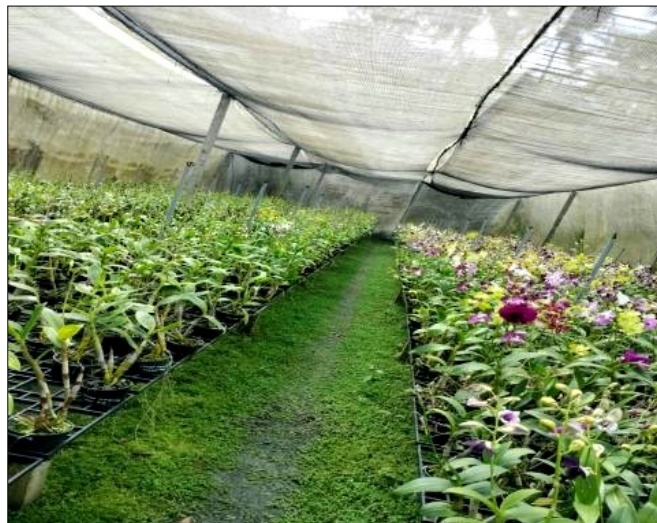
Fig. 2. Rhynco orchid site where blossom midge was identified (South India).