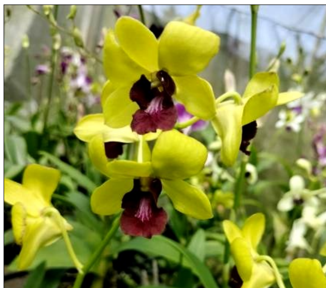
Fig. 3. Dendrobium spp. where midge gets attracted.