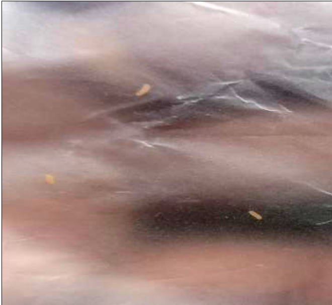
Fig. 5. Larval image on rearing.

The ecology of the midge focuses on understanding how each life stage interacts with the floral environment. The blossom midge on orchids reproduced year-round in Hawaii, with a total life cycle from egg to adult lasting approximately 21–28 days. The rearing of the larval stage is shown in Fig. 5.