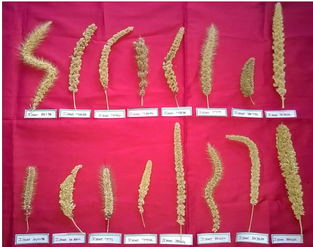
Fig. 4. Morphological Variation in panicle architecture with in Setaria italica accessions.