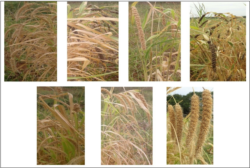
Fig. 1. Variation in inflorescence compactness.