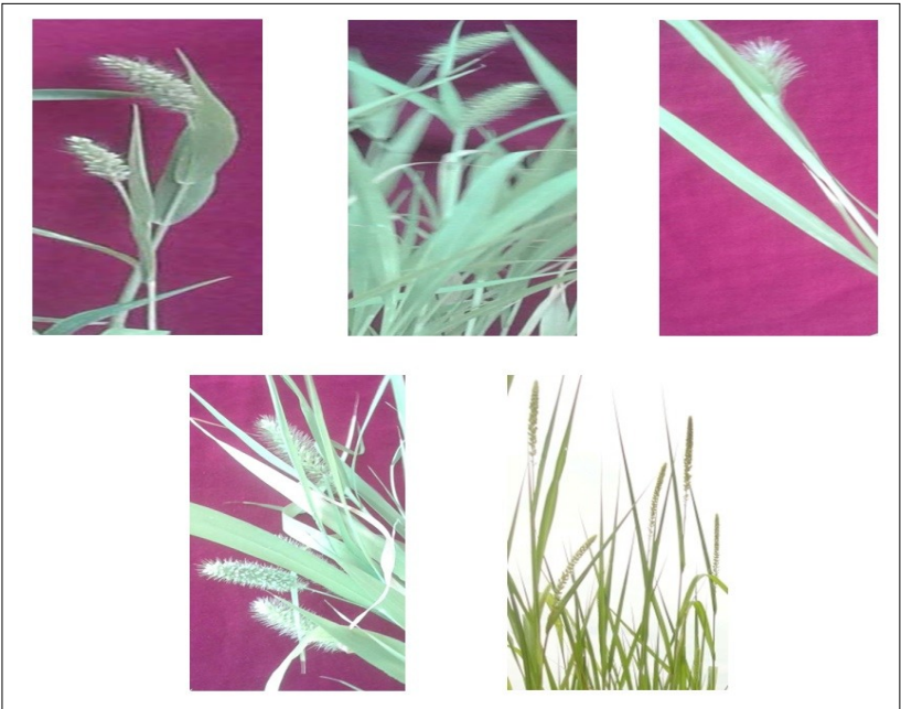
Fig. 2. Variation in inflorescence shape.