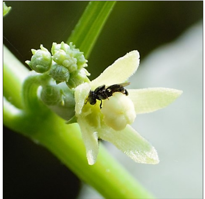
T. iridipennis on a female chayote flower