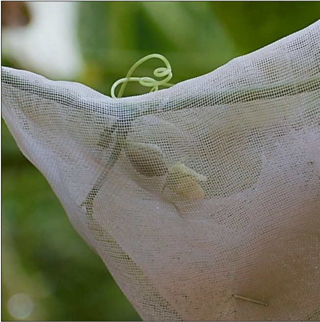
Fig. 3. Pollination exclusion in chayote flower.