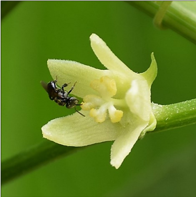
T. iridipennis on a male chayote flower