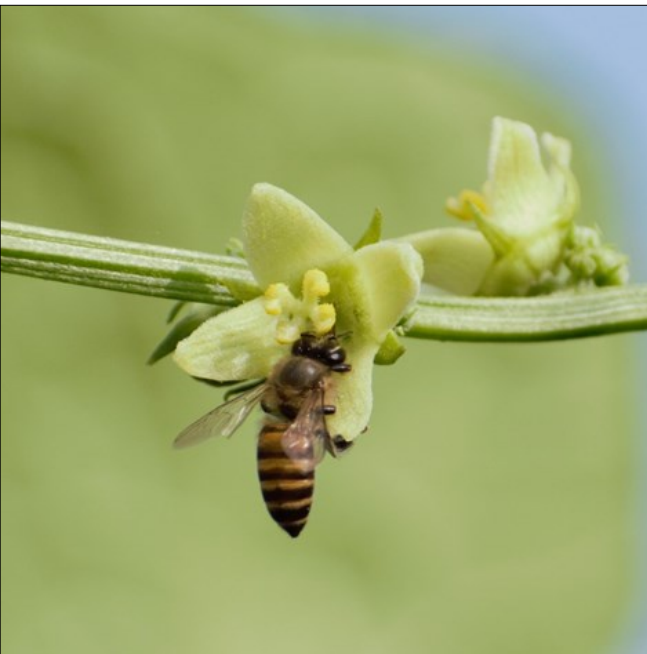
Apis cerana indica on a male chayote flower