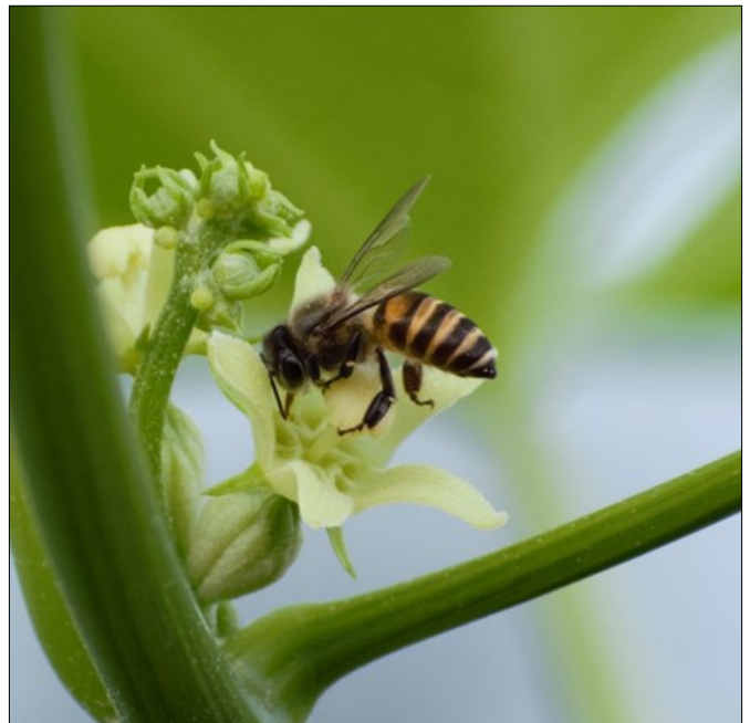
Apis cerana indica on a female chayote flower