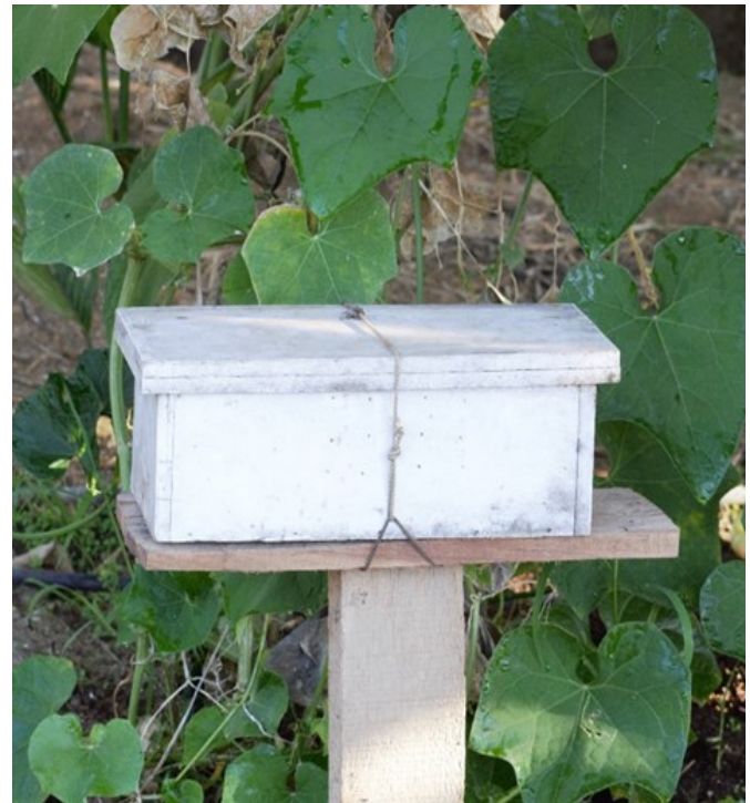
Fig. 1. Domesticated T. iridipennis colony in chayote field. marked.

Three treatments were framed to find out the contribution of managed bee pollinator T. iridipennis in improving the yield of chayote. T1 - pollination exclusion (female flowers were covered with sleeve net cages at bud stage to prevent the entry of pollinators), T2 - managed bee pollination (Fig. 1) (combination of managed bee pollinator and native pollinator) and T3 - Open pollination (native pollinators) with seven replications. Observations were recorded at 15-day interval in randomly selected five plants for each replication from 5 flowers/plant