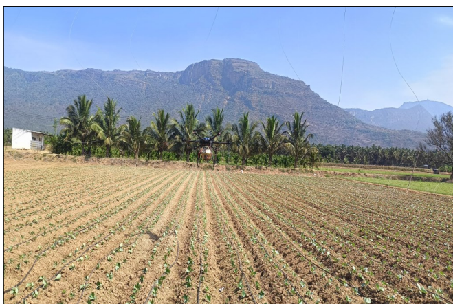
Fig. 2. Agricultural drone spraying in vegetable crops (cabbage).

usage and minimizing environmental impact. This precision also helps in preventing damage to the crops themselves.