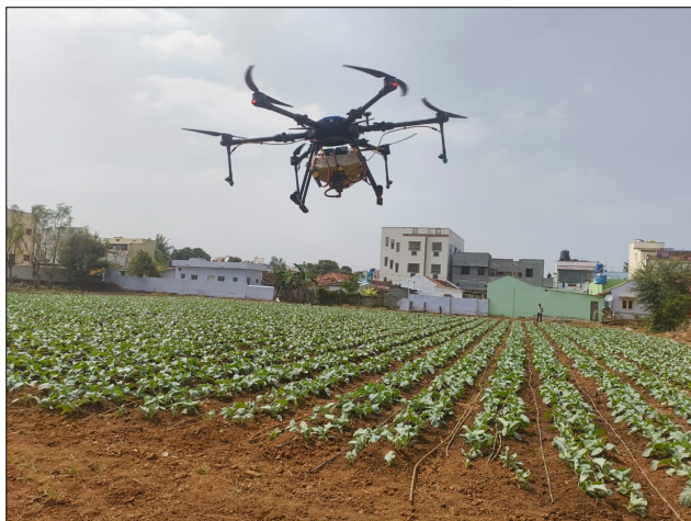
Fig. 1. Agricultural drone spraying in vegetable crops (cauliflower).