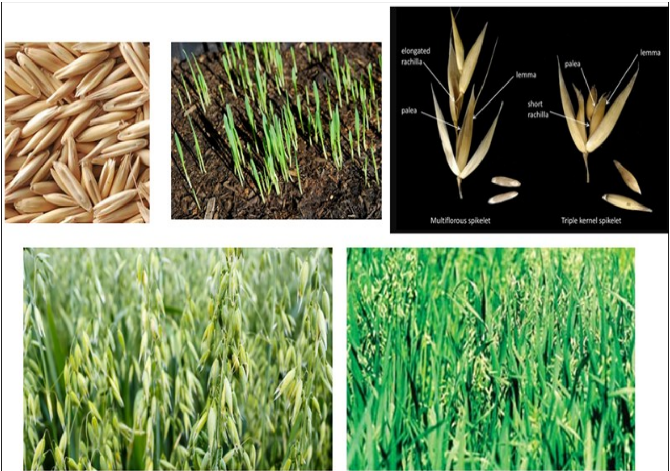
Fig. 1. Varied growth stages of oats plants, including seeds, seedlings, vegetative stage and mature stage of seed and for fodder crop.