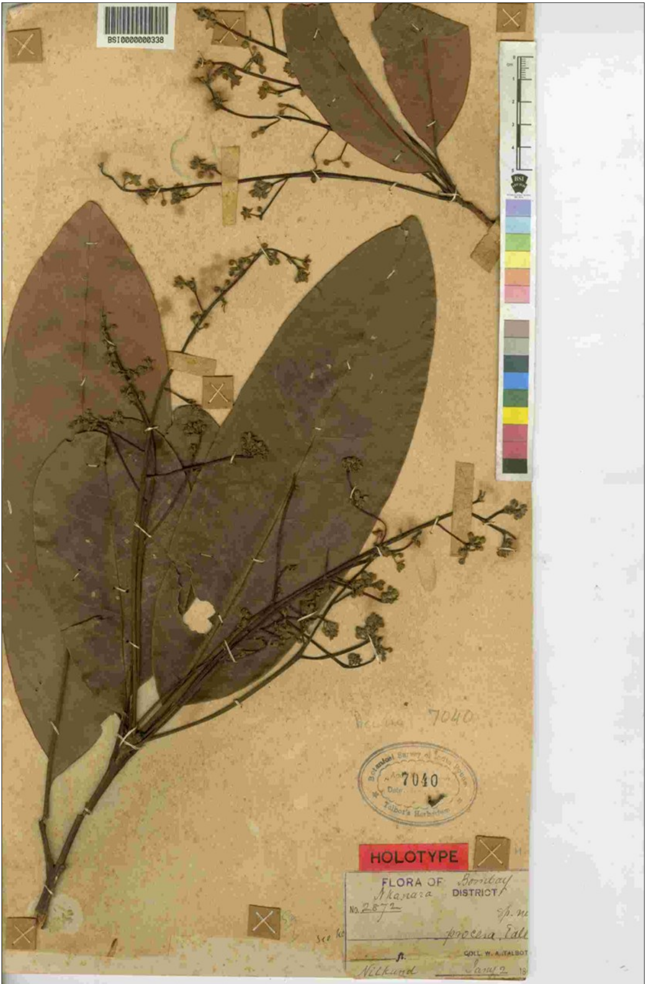
Fig. 4. Lectotype of Cryptocarya procera (BSI0000000338)