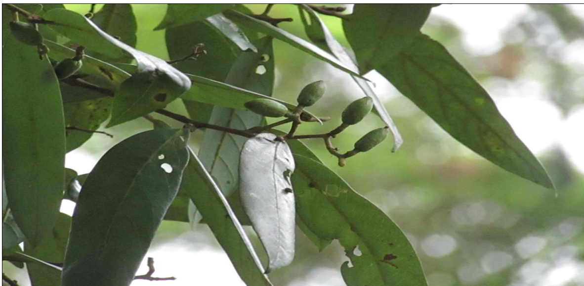
Fig. 2. Field image of Cryptocarya muthuvariana .