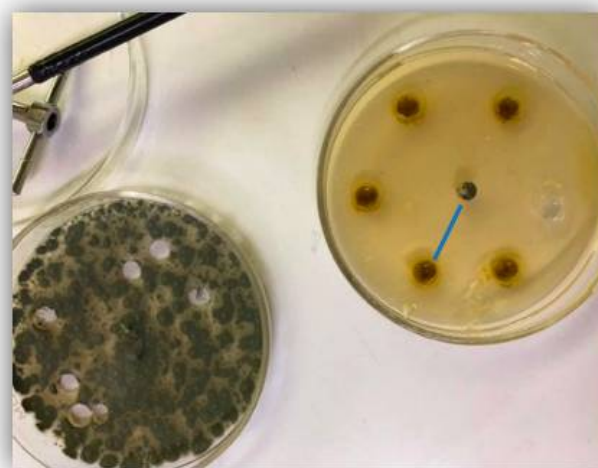
Fig. 1. Antifungal assay using agar-well diffusion method.

Agar well diffusion method was utilized to determine the biological activity of B. blumeana (kawayang tinik) against A. niger and P. chrysogenum . In this method, a 3 mm diameter fungal or mycelium disk was placed at the center of the petri dish while various kawayang tinik extracts were placed in wells distributed in even distances around the fungal disk culture (Fig. 1). Fluconazole 1 mg/ml was used as positive control while sterile water and 95% ethanol were used as negative controls. After 72 hrs of room incubation, antifungal activity was determined by measuring the inhibition zones formed between the extracts and the mycelium disk. The zone of inhibition (ZOI) is measured by obtaining the distance of mycelium growth from the disk towards the individual kawayang tinik extracts as indicated by the blue line (Fig. 1). As shown by various studies, mycelium or fungal species grown on