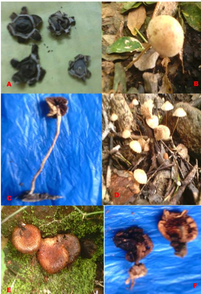
Fig. 1. A. Upper spore bearing fruiting body of Geastrum triplex B. Upper surface of cap and stipe of Marasmius oreades C. Gill surface of Marasmius oreades D. Fruiting body of Marasmius siccus on leaf litter E. Upper cap surface of Flammulina velutipes , F. The gilled area of Flammulina velutipes ,