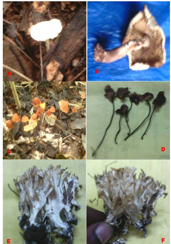
Fig. 2. A. milky white colour cap of Lactarius piperatus B. Gilled area of the Lactarius piperatus C. fruiting body of Marasmius fulvoferrugineus on leaf litter D. Dried specimen of Marasmius fulvoferrugineus E. fruiting body of Artomyces microsporus mushroom on soil F. Branching pattern of Artomyces microsporus mushroom.