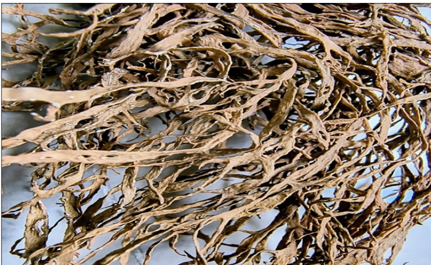
Fig. 4. Growth form of Ramalina nervulosa .

The present documentation significantly enhances the existing knowledge of Indian lichen diversity establishing a robust baseline for future biodiversity inventories, long-term ecological monitoring and conservation prioritisation in Northeast India, a