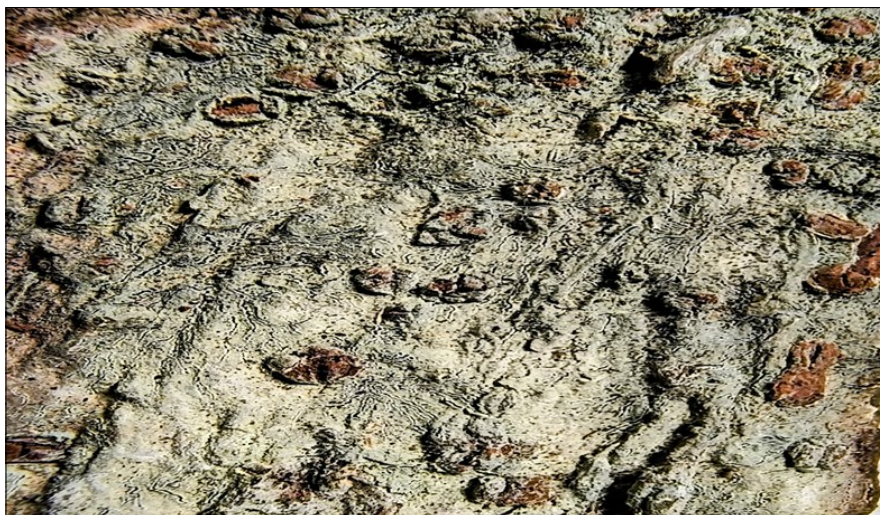
Fig. 2. Habitus of Herpothallon antillarum .