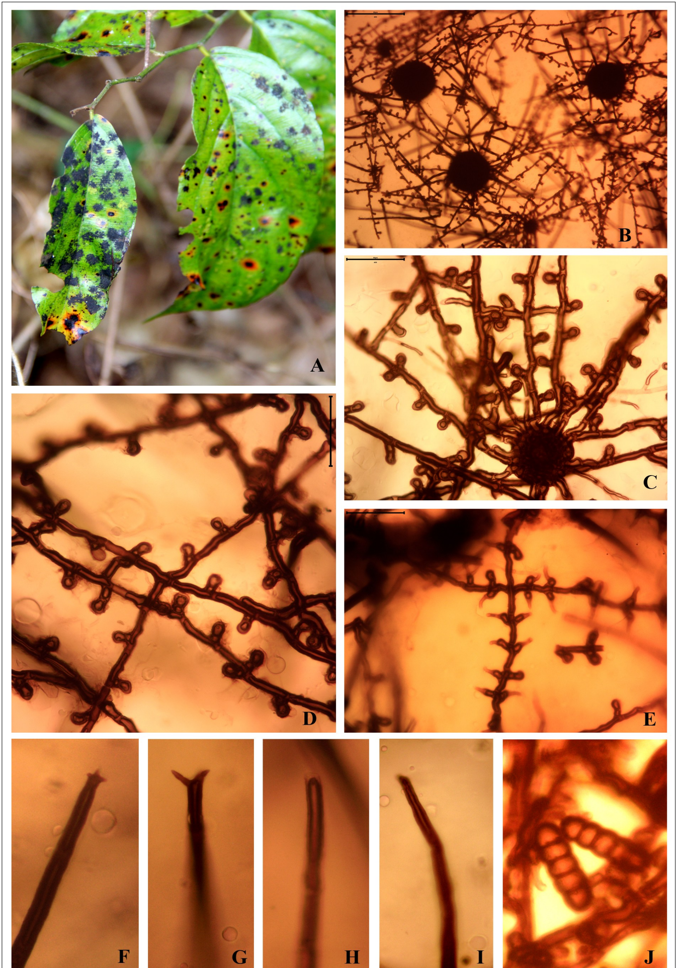
Fig. 2. A: Infected leaves of Colubrini asiatica (L.) Brongn.; B: Colony with Perithecia; C, D: Appressoriolate mycelium; E: Hyphae showing phialides mixed with Appressoria; F-I: Apical portion of the mycelial setae; J: Ascospores.