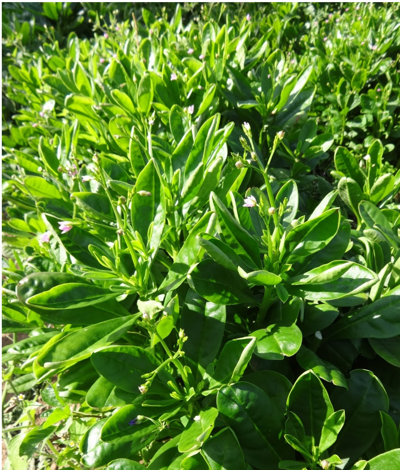
Fig. 1. Talinum triangulare .

non-polar compounds. Polar solvents are usually used to extract polar compounds and non-polar compounds for non-polar compounds. Previous studies have reported on the hepatoprotective effect (47) antidiabetic effect (48), antioxidant (49) and other biological activities (48) of T. triangulare . Reports are on the bioactive phytochemicals of the leaves of T. triangulare displaying various biological properties (50) (Fig. 2). Quercetin, one of the bioactive ingredients is shown to have analgesic, antiallergenic,