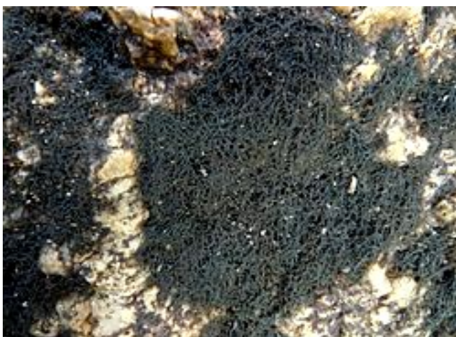
g) Filamentous lichen e.g. Ephebe lanata