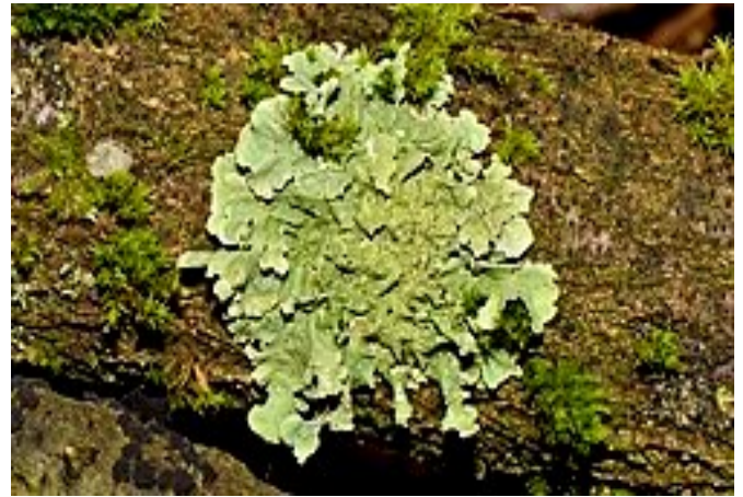
b) Foliose lichen e.g. Flavoparmelia caperata