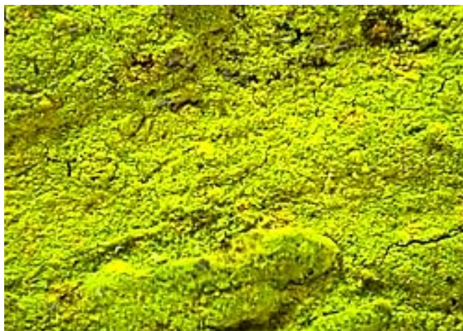
e) Leprose lichen e.g. Chrysothrix xanthina