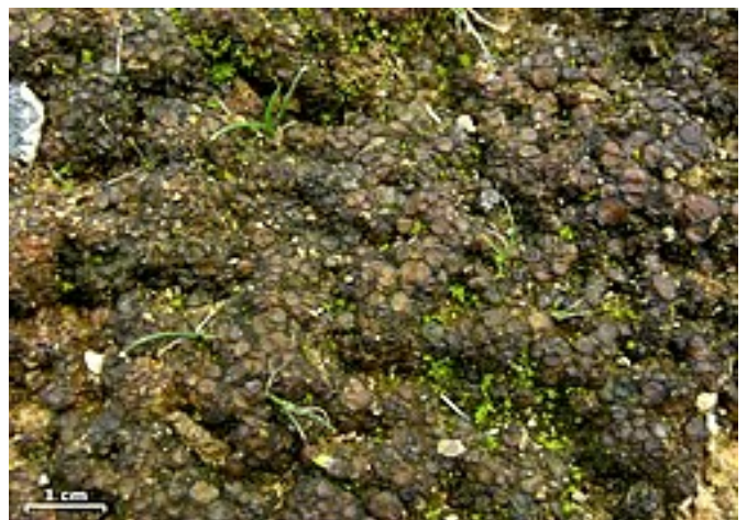
f) Gelatinous lichen e.g. Collema bachmanianum