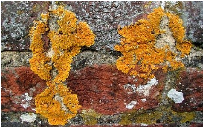
c) Crustose lichens e.g. Lecidella elaeochroma