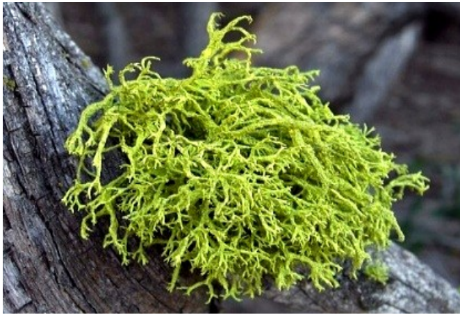
a) Fruticose lichen e.g. Letharia vulpina