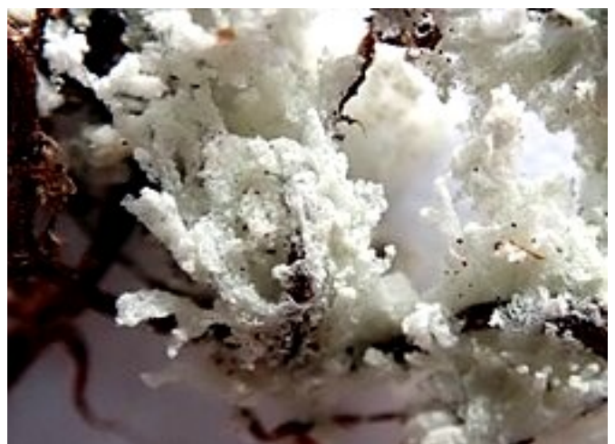
h) Byssoid lichen e.g. Roccellinastrum neglectum