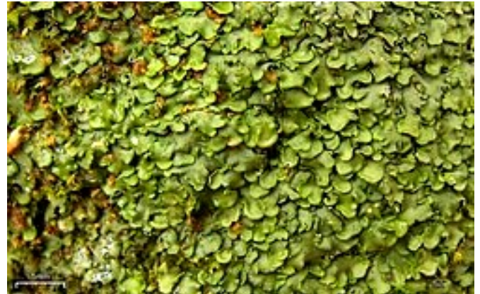
d) Squamulose lichen e.g. Placidium arboreum