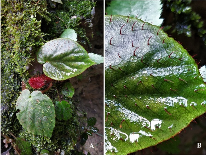
Fig. 3. Begonia limprichtii (A, B).

nate; stipules ovate, subulate, 0.9–1.3 × 0.6–0.9 cm, margin irregular with short strigose hairs, apex acuminate, outer surface puberulent, inner surface glabrous; petiole terete, red; lamina orbicular to widely ovate 5–15 × 3.5–12 cm, margin serrate, apex acute, base cordate, basal lobes overlapping or nearly so, sparsely covered with red strigose hairs, 1–2 mm long; venation palmate, veins 6–7. Inflorescences axillary with 5–9 flowers. Flowers monoecious. Staminate flower: pedicels 0.9–1.2 cm long, white; tepals 4; the outer 1.1–1.5 × 0.6–1 cm; stamens 30–50, filament ca 0.5 mm across. Pistillate flower: pedicels 0.6–1 cm long, tepals 4–5, 0.8–1.5 × 0.4–1 cm, reddish white; style bifid from middle, 0.1–0.5 cm, yellow.