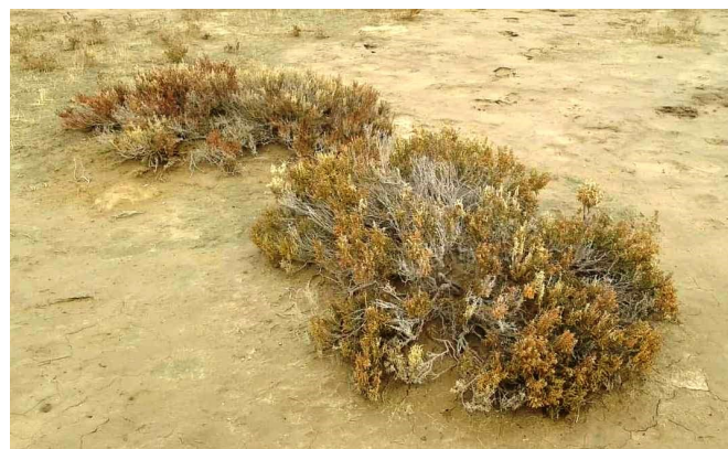
Fig. 1. Halocnemum strobilaceum (Pall.) M. Bieb. in Kyzylkum desert, Uzbekistan.

A total of 20 isolates of endophytic bacteria were isolated from tissues of Halocnemum strobilaceum (Pall.) M. Bieb (Fig. 1). The isolates were called HAST1-HAST20 as abbreviations of first two letters from words Halocnemum strobilaceum .