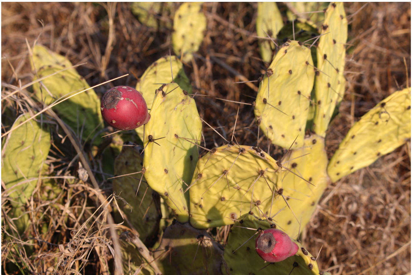
Fig. 1. Opuntia elata photographed in Chachacha growth point, Shurugwi district, south-central Zimbabwe.