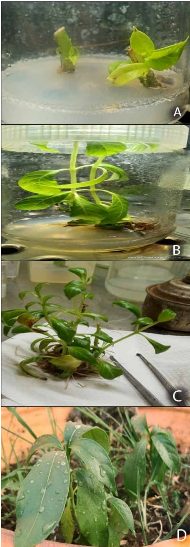
Fig. 1. in vitro propagation of P. thyriformis , A; explant initiation at BM3 media after 9 days of explant culture, B & C; shoot multiplication and root formation at BM3 media after 42 days of explant culture, D; Hardening

room temperature (25 °C) after treated in 1 mg/l to 5 mg/l IBA for 1-2 hrs. The explants formed the highest average of 32 roots per explants of P. thyriformis , and the lowest average roots per explants were observed in the 4 mg/l IBA concentration (Table 4). The shoots were grown in pots containing vermicompost and soil mixture. All the explants survived in environmental conditions (Fig. 1.D).