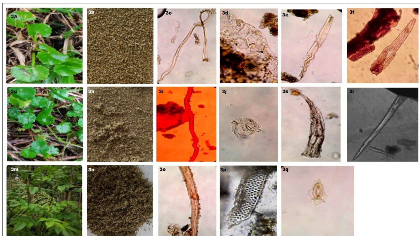
Fig. 3. Photomicrographs of microscopic evaluation (400x). 3a. Centella asiatica plant, 3b. C. asiatica whole plant powder, 3c. Fibre, 3d. Stomata, 3e. Fibre, 3f. Trichome, 3g. Hydrocotyle sibthorpioides plant, 3h. H. sibthorpioides whole plant powder, 3i. Fibre, 3j. Stomata, 3k. Trichome, 3l. Hair, 3m. Senna hirsuta plant, 3n. S. hirsuta leaf powder, 3o. Trichome, 3p. Pitted vessel, 3q. Stomata.

i.e. fibre provides mechanical support (71), was seen in all the plant samples except S. hirsuta . The trichomes or hairs are mainly responsible for providing protection against pathogens in addition to regulating temperature by reducing evaporation (72) whereas, stomata is associated with gaseous exchange (5).