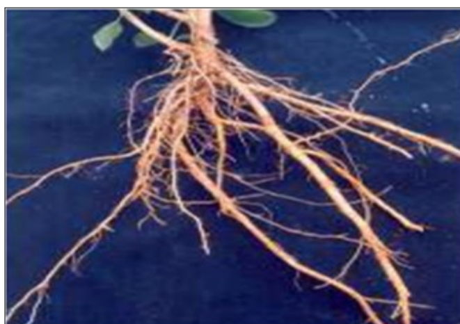
D. D. gangeticum roots.