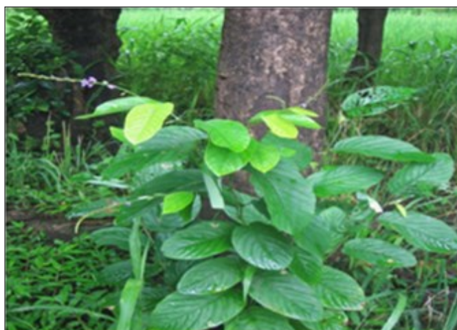
A. D. gangeticum leaves.

It is one of the essential herbs of ethnomedicine that have been used extensively either as a single drug or