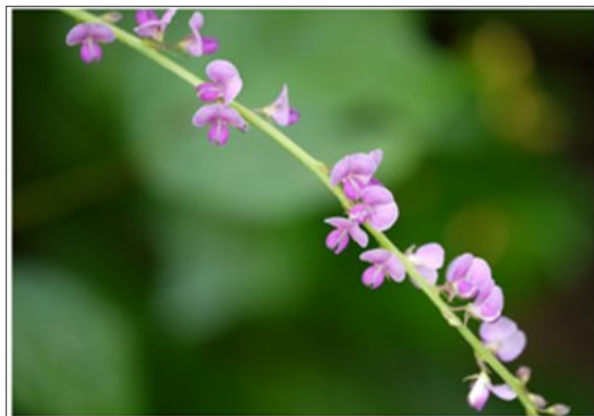
C. D. gangeticum flowers.