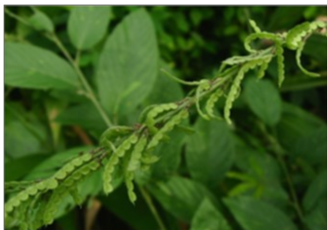
B. D. gangeticum fruits.