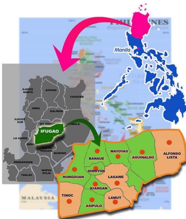
Fig. 1. Location Map of the Study

The snowball sampling approach was employed in the study to produce responders per municipality. This approach was used since there was insufficient information to create a sample frame. Using this method, a few possible respondents (known sources of information) from each barangay (village) were questioned initially, and they (1st interviewees) then named other sources of information in the community. As the procedure progressed, the number of respondents seen in table 4, grew like a snowball until the total number of required respondents, ie., 500 was attained.