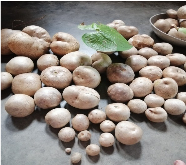
air potato bulbils harvested robustly