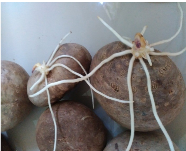
air potato bulbil sprout