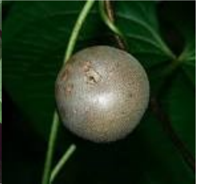
air potato bulbil growing