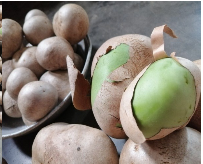
air potato bulbils when mature