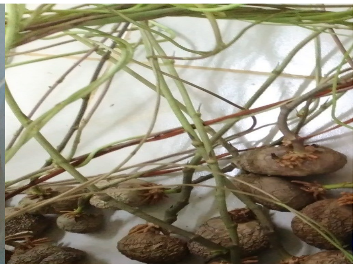
air potato bulbils ready for planting