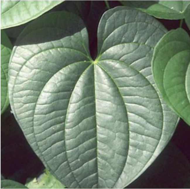
heart shaped leaves of air potato