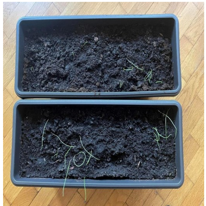
Fig. 6. Results (15 th day) with onion seeds, watered with Tap water (control sample), EVOdrop filtered water, saturated with hydrogen from EVOdrop hydrogen technology (sample).

In this regard, in Bulgaria, and in Europe in general, water filtration with zeolite is quite widespread (15-17). Shungite filtration is also applied in Europe (18-20). The achieved results of EVOagri project in Africa show the