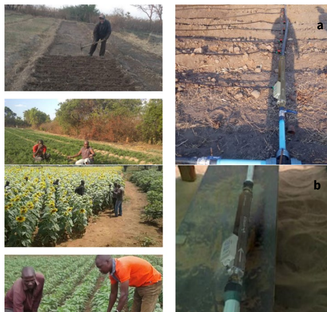
Fig. 4. Application of EVOagri technology in Africa.

The images show the application of EVOagri technology in Africa are presented in Fig. 4 a, b.