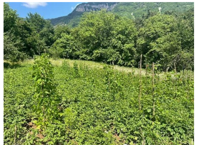
Fig. 7 Results with beans.

importance of water quality for its absorption by vegetables and for increasing their productivity. An additional analysis was done with f(E) and NES. The function f(E) is spectrum of distribution according to energies. NES is Non-equilibrium Energy Spectrum (NES). The Non-equilibrium Energy Spectrum (NES) and f(E) is measured in eV^{-1} (20, 21). Antonov's method for discrete evaporation of water drops as a physical effect was published at Harvard University (22). It is the basis for the spectral method NES (23, 24). These parameters are related to the ability of water molecules to bind into clusters, and to penetrate through the cell membrane of the plants (25-29). Table 2 illustrates the results of the comparative analyses between EVOdrop water and other waters (13, 30).