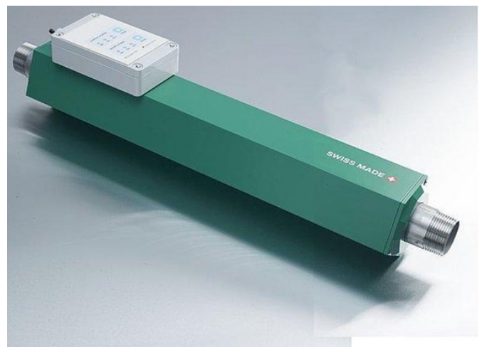
Fig 3. EVOdrop filter.

color according to Rublyovska Scale – method by Bulgarian State Standard (BDS) 8451: 1977; smell at 20°C – method BDS 8451: 1977 using technical device glass mercury thermometer, conditions No. 21; turbidity – EN ISO 7027, technical device turbidimeter type TURB 355 IR ID No. 200807088; pH – BDS 3424: 1981, technical device pH meter type UB10 ID NoUB10128148; oxidizability – BDS 3413: 1981; chlorides – BDS 3414: 1980; nitrates – Validated Laboratory Method (VLM)-NO 3 -No. 2, technical device photometer "NOVA 60 A" ID No. 08450505; nitrites – VLM NO 2 -No. 3, technical device photometer "NOVA 60 A" ID No. 08450505; ammonium ions – VLM-NH 4 -No. 1, technical device photometer "NOVA 60 A" ID No. 08450505; general hardness – BDS ISO 6058;