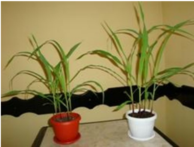
Fig. 5. Results with corn seeds of Zea mays L.

filtered water which was saturated with EVOdrop hydrogen technology called EVObooster. This water was saturated with EVOdrop hydrogen technology with pH=7.3; ORP=-390 mV; concentration of Hydrogen (H 2 ) 1.2 ppm. The control sample was with solute concentration 168 ppm. The sample was filtered from tap water with EVOdrop technology and was with 7 ppm. There were performed 10 measurements and the results are statistically significant with t-test of Student ( p < 0.10 ). The results were achieved with EVOdrop filtered device with Haberlea rhodopensis Friv (13). The effects of hydrogen (H 2 ) were described in (14)