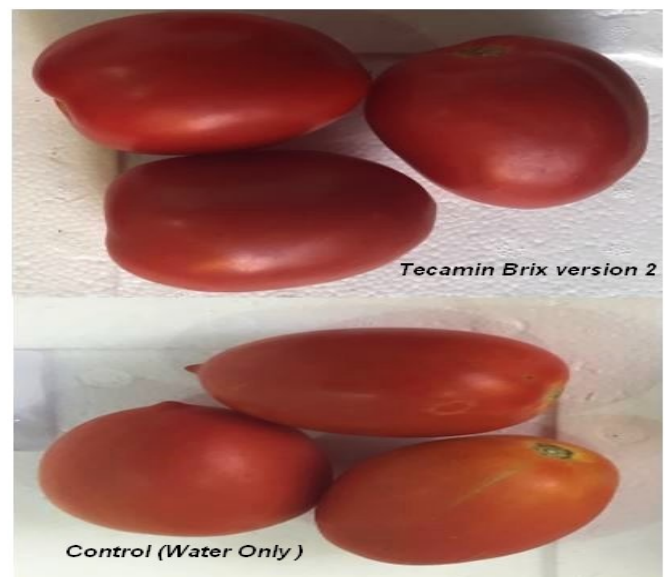
Fig. 2. Image of a representative experiment after the use of biostimulants (Tecamin Brix version 2) and without (only water). Fruit Pigment and size is largely expressed in tomato fruit ( S. lycopersicum ) with Treatments consisted of foliar application by Tecamin brix. Two treatments were used: Control (no biostimulants) and TB-Version 2, with 10 plants assigned to each treatment. Each treatment was replicated three times, resulting in a total of 60 plants.

Furthermore, the application of TB-V2 biostimulant resulted in a significant increase in two important parameters of S. lycopersicum tomatoes - fruit quality Brix and lycopene ( P < 0.001 ). The highest values recorded were 6.42 (°Brix) and 47.27 (mg/g fresh weight) respectively. In contrast, there was no statistically significant difference observed for these two parameters when using only the control group without the Tecamin Brix®-V2 biostimulant (Fig. 2).