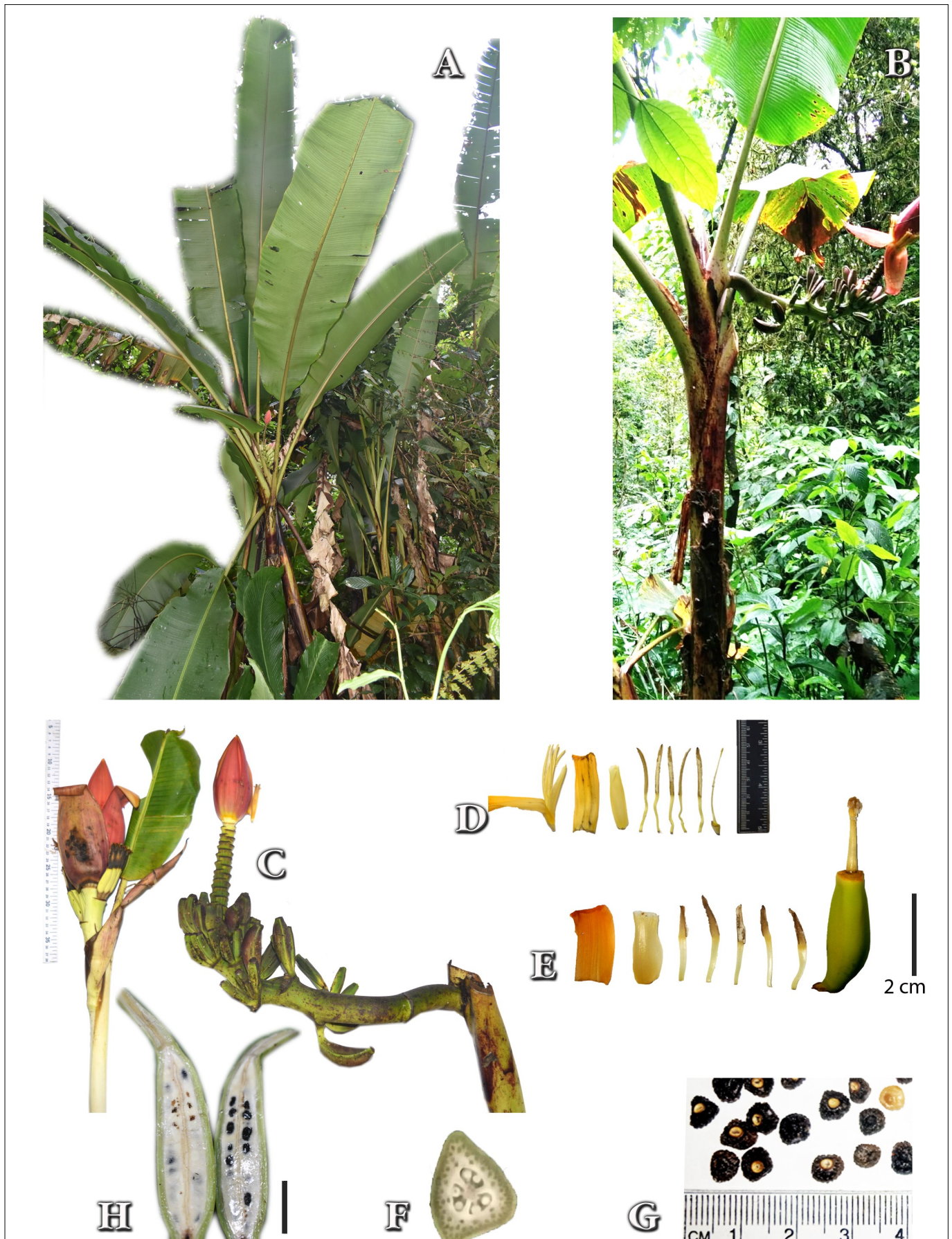
Fig. 3 Musa markkui Gogoi & Borah. A. Habit of the plant; B. Plant with fruiting body; C. female (left) and male (right) inflorescence; D. Male floral parts; E. Female floral parts; F. T.S. of trilobular ovary showing two rows of ovules in each locule; G. seeds.

erect or with a horizontal curve, sterile bract elongated, light pink, deciduous; peduncle yellow-green, which turns dark green to purple on maturity, to 20 × 8 cm, slightly pubescent, with 1 empty node. Female bud lanceolate,