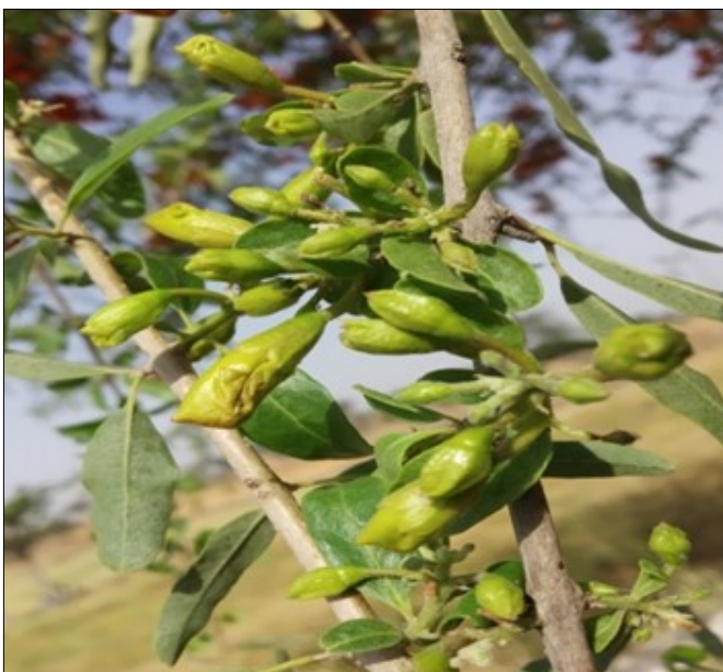
Fig. 1. Inflorescence of Tecomella undulata .