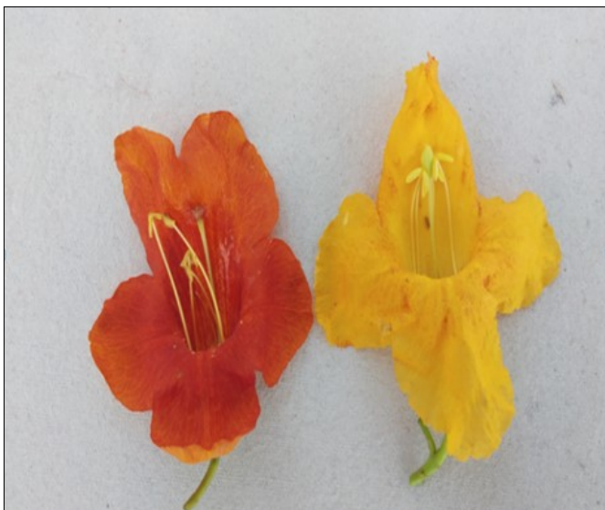
Fig. 4. Colour variability of flower in Tecomella undulata .