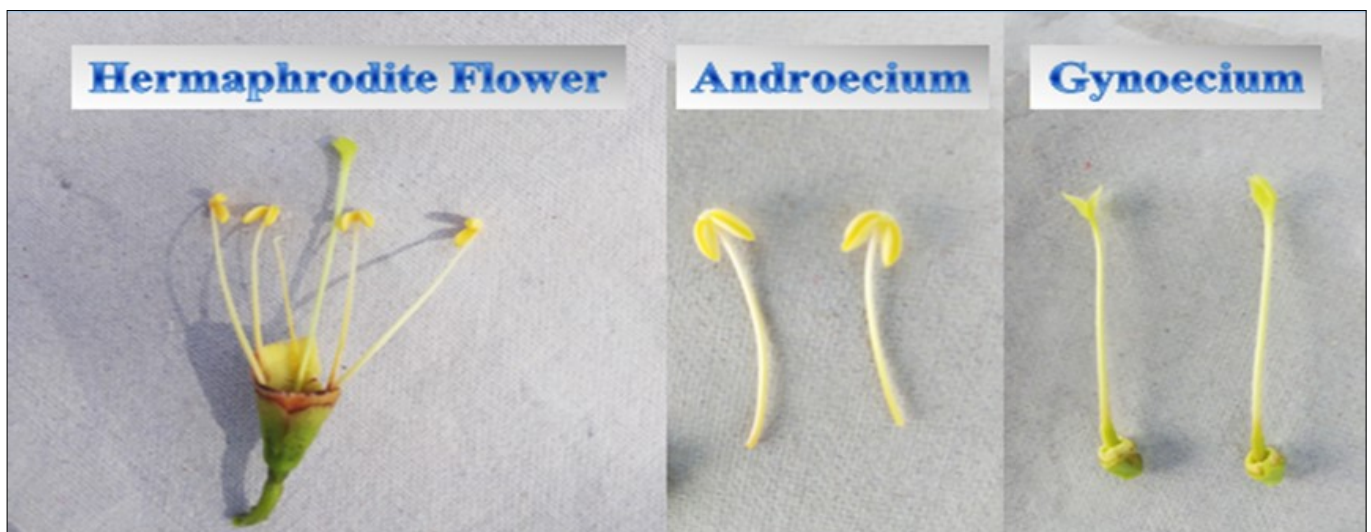
Fig. 5. Complete flower showing Androecium and Gynoecium part.

began between 0500–0600 h, and the peak blooming (37.21%) was recorded between 0800–0900 h. Most buds opened by 1100 h; however, anthesis continued until 12 h. The dehiscence of anthers began at approximately 0730 h and continued until 1130 h, with the highest frequency between 0800–0950 h.