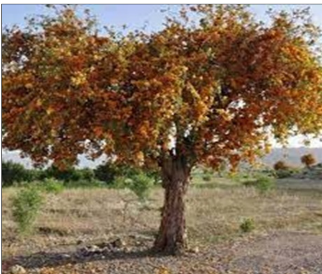
Fig. 2. Full bloomed tree of Tecomella undulata .

initiation to opening. The lifespan of a bud was divided into five distinct stages (Table 1 and Fig. 3), summarized as follows: