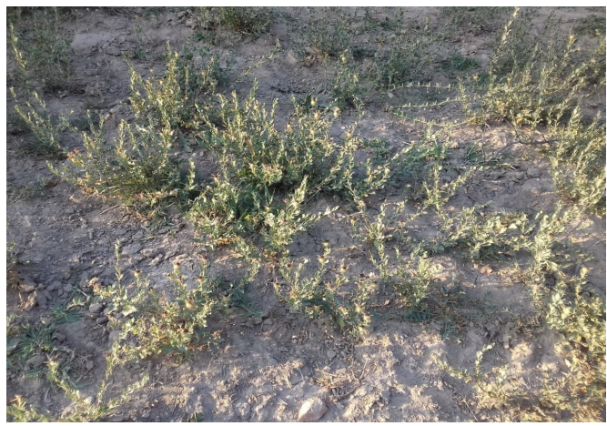
Fig. 1. General view of Hulthemia persica.

The Ustyurt is an elevated plateau with absolute elevations of 160–300 m above sea level. On almost all sides, the plateau is bounded by cliffs or chinks. To the North, the Ustyurt Plateau borders the Caspian lowland; to the East, the drained bottom of the Aral Sea; to the South, the Amu Darya Delta and Sarykamysh Plain and to the west, the Caspian Sea. The borders of Uzbekistan, Turkmenistan, and Kazakhstan pass through the area covered by the plateau and the total area of the Ustyurt Plateau is 21.2 million ha, of which the Karakalpak part accounts for 7.2 million ha. The climate of the Ustyurt Plateau is highly continental, characterized by hot, dry summers and rather severe winters, accompanied by strong winds and low precipitation (12).