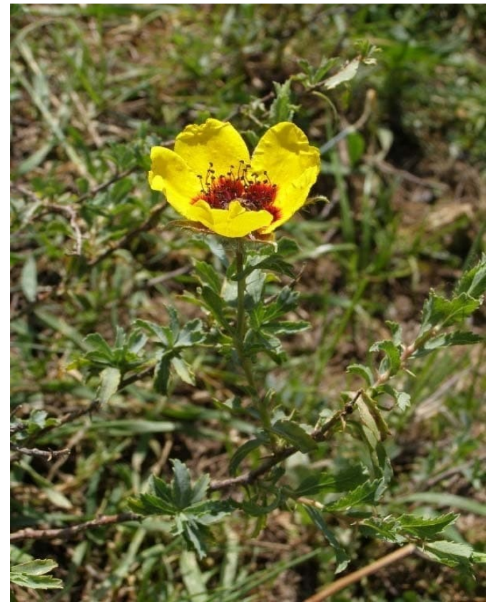
Fig. 2. Flowering Hulthemia persica plant.

The research object is Hulthemia persica , a shrub similar to low rosehip (Fig. 1). In young generative plants, annual shoots reach 30-40 cm in height. The plant is shortly pubescent, with branchy stems. The spikes are single, alternate, paired, and opposite. The leaves are simple, stiff, hairy, obovate, up to 20-25 mm in length and up to 10-15 mm in width in the middle part of the shoot. The flowers are golden yellow with a dark purple spot at the base (Fig. 2). The length and width of the fruits are almost the same (approximately 10 mm). Flowering was observed in April and July and fruiting was observed in June and August. The plant grows from spring to the onset of autumn frosts.