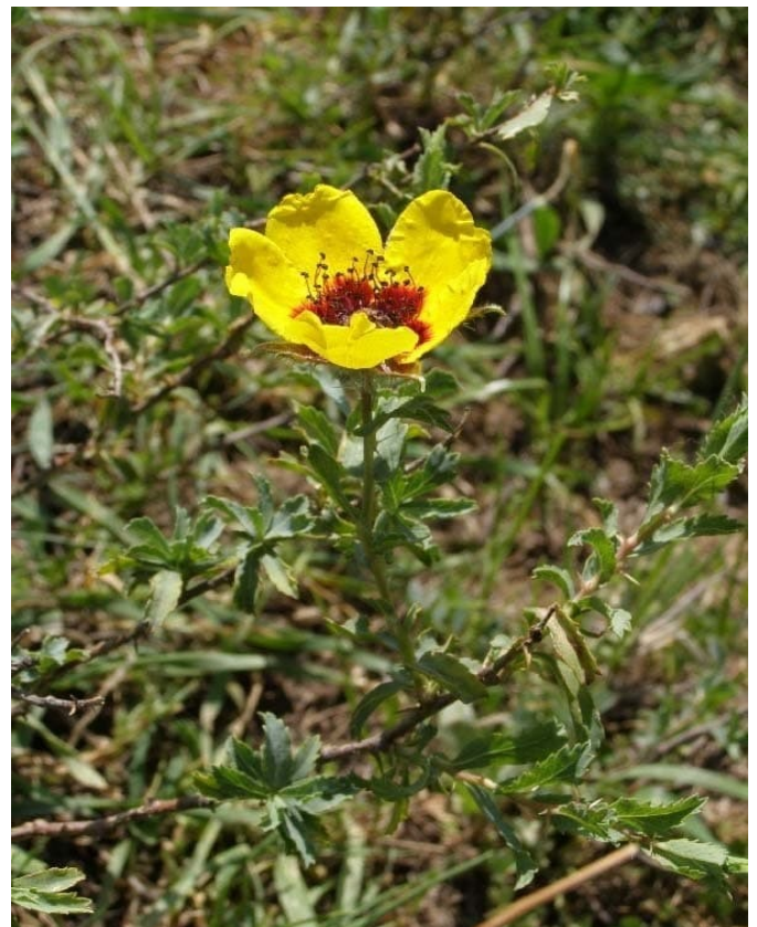
Fig. 2. Flowering Hulthemia persica plant.

The research object is Hulthemia persica , a shrub similar to low rosehip (Fig. 1). In young generative plants, annual shoots reach 30-40 cm in height. The plant is shortly pubescent, with branchy stems. The spikes are single, alternate, paired, and opposite. The leaves are simple, stiff, hairy, obovate, up to 20-25 mm in length and up to 10-15 mm in width in the middle part of the shoot. The flowers are golden yellow with a dark purple spot at the base (Fig. 2). The length and width of the fruits are almost the same (approximately 10 mm). Flowering was observed in April and July and fruiting was observed in June and August. The plant grows from spring to the onset of autumn frosts.