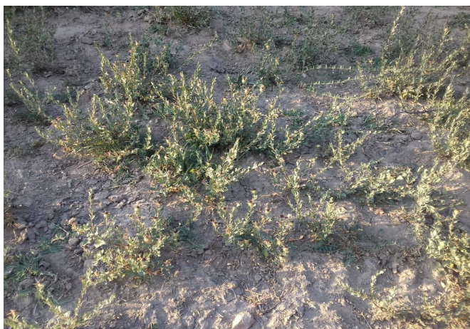
Fig. 1. General view of Hulthemia persica (Photo by Nodira Rakhimova).

The Ustyurt is an elevated plateau with absolute elevations of 160–300 m above sea level. On almost all sides, the plateau is bounded by cliffs or chinks. To the North, the Ustyurt Plateau borders the Caspian lowland; to the East, the drained bottom of the Aral Sea; to the South, the Amu Darya Delta and Sarykamysh Plain and to the west, the Caspian Sea. The borders of Uzbekistan, Turkmenistan, and Kazakhstan pass through the area covered by the plateau and the total area of the Ustyurt Plateau is 21.2 million ha, of which the Karakalpak part accounts for 7.2 million ha. The climate of the Ustyurt Plateau is highly continental, characterized by hot, dry summers and rather severe winters, accompanied by strong winds and low precipitation (12).