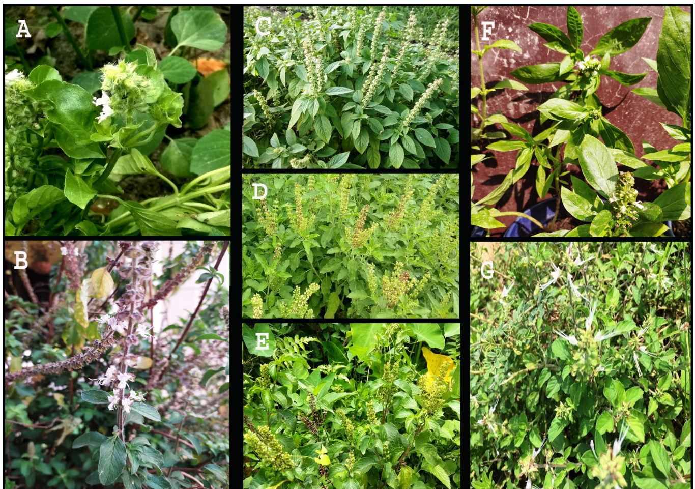
Fig. 2. Ocimum L. species distributed in India (A) O. africanum Lour. (B) O. kilimandscharicum Gürke (C) O. americanum L. (D) O. tenuiflorum L. (E) O. gratissimum L. (F) O. basilicum L. (G) O. filamentosum Forssk

In the artificial (arbitrary) system of classification, Theophrastus tells of Basil ( O. basilicum ) as herbaceous plants with woody roots, flowering for a long duration (2). According to Pliny, the Elder Ocimum must be avoided as it is detrimental to human health, similar to the belief of Chrysippus. He mentioned around 35 remedies of Ocimum used by people in succeeding ages (23). Dioscorides sketched out Ocimum (Basil) in aromatics ( Okiminon ), living creatures ( Okimon ), roots ( Akinos ), and other herbs and roots in Okimoides ( Ocimoideae ). Four species exist in Okiminon and Okimone ; one in Akinos ; two in Okimoides . The Akinos and Okimoides are also familiar as Ocimastrum (a name given by Romans) (3). Casper Bauhin cited Ocimum as Okimon Dioscoridi, a more than hundred-year-old odoriferous genera with 11 species. The species differ in leaf size, aroma, and corolla color. The 11 species and their synonyms were named as per the binomial system of nomenclature (24). Andrea Caesalpino kept Ocimum inside Ocimoides , which, in turn, contained herbs and suffruticose