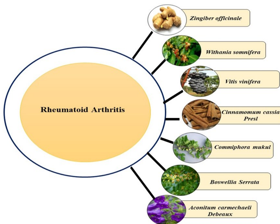
Fig. 2. Some plants helpful in the treatment of Rheumatoid arthritis.

Boswellia serrata is another herb that has been traditionally used to treat inflammatory conditions, including RA. The resin of this plant contains compounds that have been shown to have anti-inflammatory and analgesic properties. Some studies have found that its supplements may be effective in reducing joint pain and stiffness in patients with RA (41). Devil's claw ( Harpagophytum procumbens ) is another herb that may be beneficial for RA. Devil's claw contains compounds that have anti-inflammatory and analgesic properties and has been found to reduce pain and improve mobility in patients with RA (8, 42).