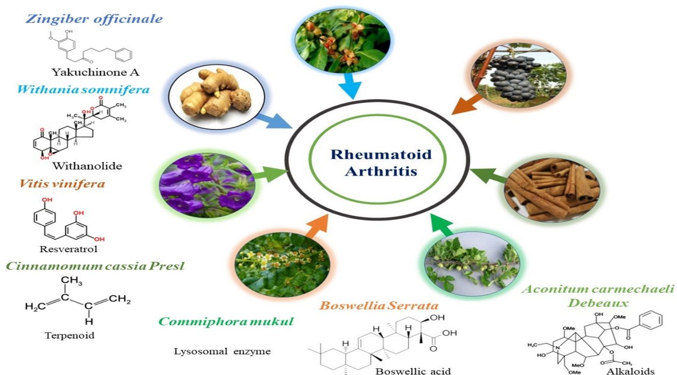
Fig. 3. Medicinal plants and their phytoactive compounds, useful for the treatment of Rheumatoid Arthritis.