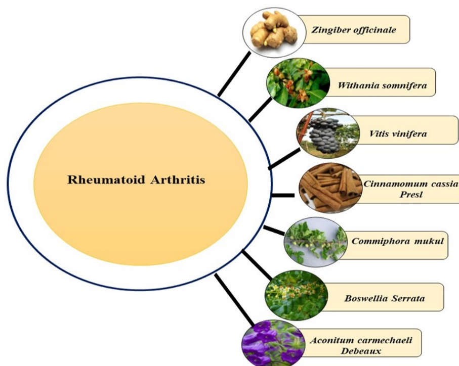
Fig. 2. Some plants helpful in the treatment of Rheumatoid arthritis.

Boswellia serrata is another herb that has been traditionally used to treat inflammatory conditions, including RA. The resin of this plant contains compounds that have been shown to have anti-inflammatory and analgesic properties. Some studies have found that its supplements may be effective in reducing joint pain and stiffness in patients with RA (41). Devil's claw ( Harpagophytum procumbens ) is another herb that may be beneficial for RA. Devil's claw contains compounds that have anti-inflammatory and analgesic properties and has been found to reduce pain and improve mobility in patients with RA (8, 42).