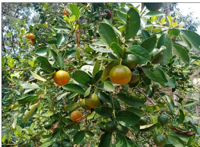
Fig. 1. Citrus mitis Blanco

The extraction process was carried out following previously published methods with minor modifications (4). In brief, ten grams of powdered peels and pulps were subjected to maceration with 200 ml of 80% ethanol and water solvents at approximately 25 °C for 48 hours. The resulting mixture underwent filtration using Whatman No.1 filter paper, and the residue was subjected to two additional extraction cycles using the same procedure. The filtrates from each extraction were concentrated under reduced pressure using a rotary evaporator, yielding crude extracts. For analysis, the crude extracts were re-dissolved in dimethyl sulfoxide (5% DMSO) to a concentration of 100 mg/mL. The solution was then transferred to glass bottles and stored at 4 °C until use. The percentage yield of crude extracts from C. mitis was determined and expressed as % w/w of the dry sample.