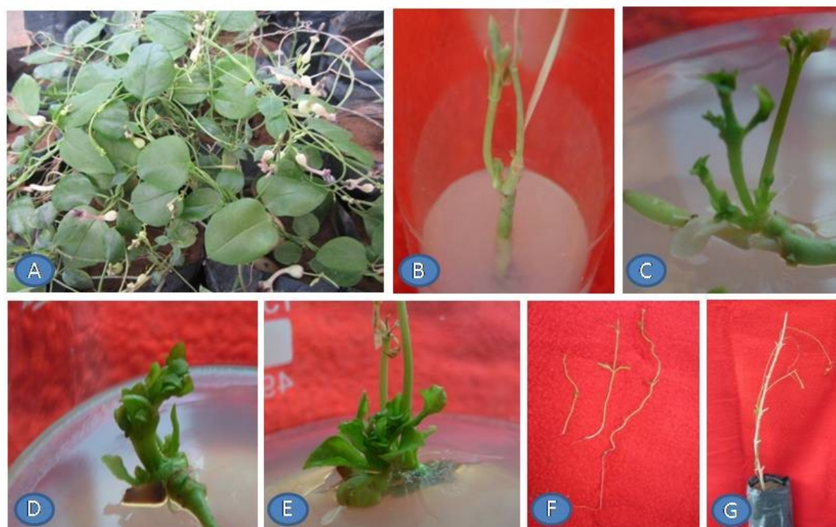
Figure 1. Shoot bud induction, multiple shoot production and rooting protocols for Ceropogia bulbosa . (A): C. bulbosa grown in green house condition, (B): Bud breaking from nodal segments on MS medium containing BAP (2.0 mg l -1 ) after 2 weeks, (C-E): Multiple shoot induction on MS medium containing BAP (0.25 mg l -1 ) + kinetin (0.25 mg l -1 ) + IAA (0.1 mg l -1 ), (F): Ex vitro rooted shoots pre-treated with IBA (100 mg l -1 ) for 3-4 min., (G): Successfully hardened plants of C. bulbosa .