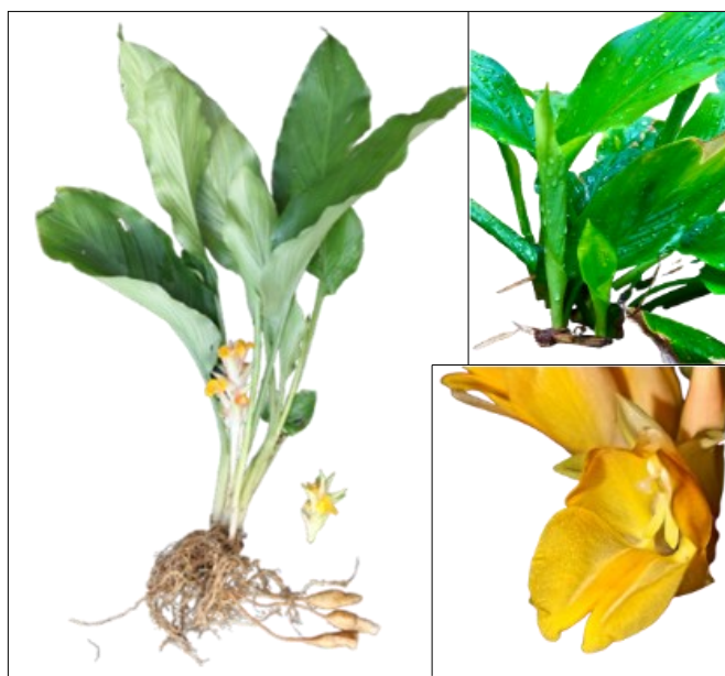
Fig. 1. Photographs of the parts of C. sahuynhensis Škorničk. & N.S. Lý.

The plant materials were washed and dried in the shade, then ground into a coarse powder and prepared to