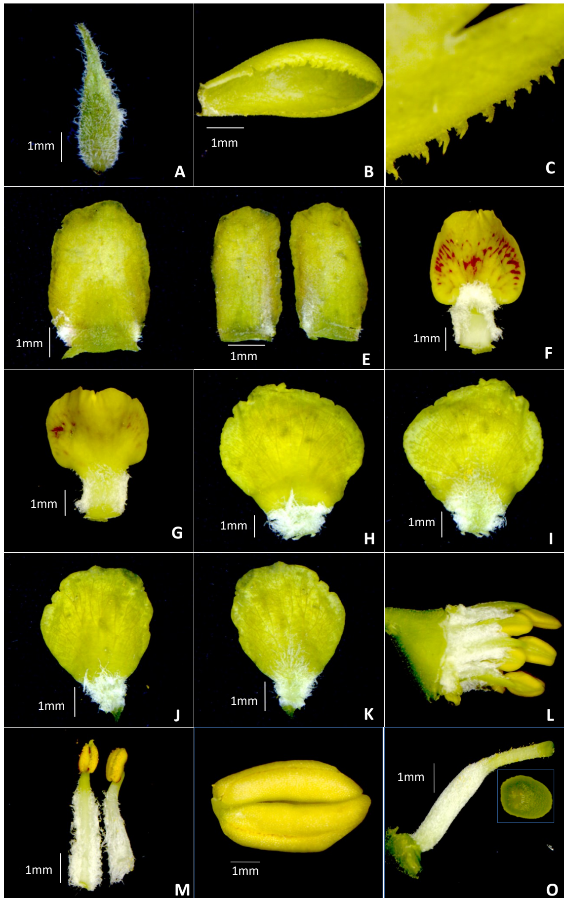
Fig. 2. Tara cacalaco (Bonpl.) Molinari & Sánchez Och.— A: Bract; B: Anterior sepal; C: Anterior sepal margin; D: Upper lateral sepal; E: Lower lateral sepal; F & G: Standard petal inner and outer surface; H & I: Upper lateral petal inner and outer surface; J & K: Lower lateral petal inner and outer surface; L: Stamens arrangement; M: Stamen; N: Anther; O: Carpel.