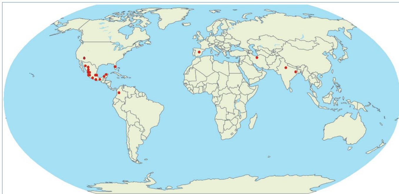
Fig. 4. Distribution of T. cacalaco .

Tara cacalaco is indigenous to various regions in Mexico, including Campeche, Chipas, Colima, Jalisco, Guerrero, Guerrero, Guerrero, Jalliso, Michoacán, Oaxaca, Pubela, Dorantes Sinaloa, Veracruz, and Yucatán. Despite its native distribution, it has been introduced to several other countries such as Columbia, Spain, the United States, Iran, and India (Fig. 4), indicating its adaptability and potential for cultivation outside its natural range.