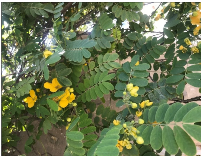
Fig. 1. Cassia angustifolia ( Senna alexandrina Mill).

The immunomodulatory effect of ethanol leaf extract of C. angustifolia was investigated on the effect RAW 264.7 macrophages cells via measuring cell viability after treatment with different doses from extract at different time exposure. The final concentration of extract was 125, 250, 500 and 1000 \mu\text{g}/\text{mL} , the method was done as described by Abood (9).