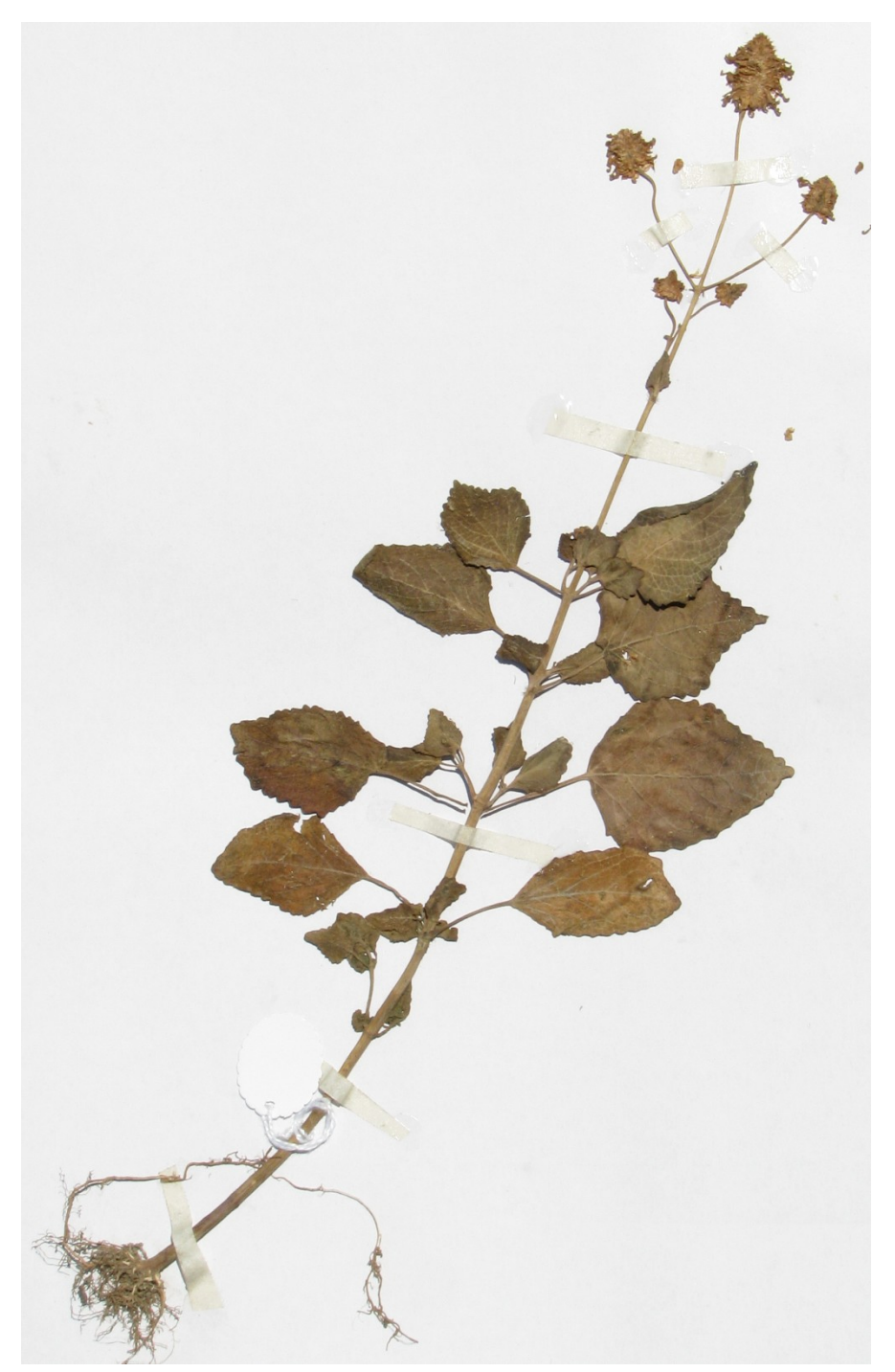
Fig. 1. Herbarium specimen of Anisochilus carnosus (Ashfaq Ali 56).

Anisochilus carnosus (L. f.) Wall. ex Benth. in N.Wallich, Pl. Asiat. Rar. 2 (5): 18. 1830. Lavandula carnosa, L.f : Suppl. Pl. 273. 1782 [1781 publ. Apr 1782]. Anisochilus crassus Benth., Prodr.12: 81.1848. Anisochilus decussatus Dalzell & Gibson., Bombay Fl. 206.1861. Anisochilus rupestris Wight ex Hook. f., Fl. Brit. India 4: 627.1833.