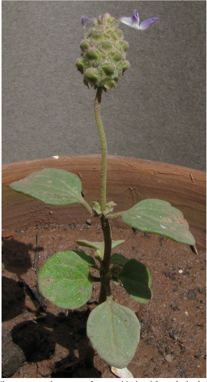
Fig. 2. Anisochilus carnosus plant grown from seed isolated from the herbarium specimen

tube with 1.5-2.0 mm dilated base and an upper lip of 2.0 - 3.0 mm long, reflexed, acute, tip of upper lip suffused with red/pink, fruiting calyx dilated, 7- 8 mm long; corolla purple, 6-9 mm long, tube slender, exerted, recurved, visible part 4 mm long, densely covered with soft hairs and red glands, upper lip up to 3 mm long, shorter than lower lip, 4 lobed, lateral lobes transparent to white, smaller, middle lobes purplish, lower lip up to 4-5 mm long, concave/boat shaped; stamens 4, anthers dark purple, dorsifixed. Nutlets 4, broadly ovate, black, 1 × 0.8 mm, inconspicuously emarginated at apex.