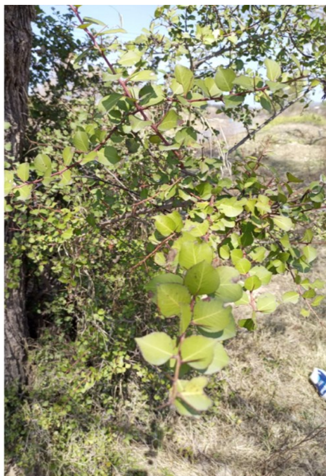
Fig. 1. Collection site (Soon Valley).