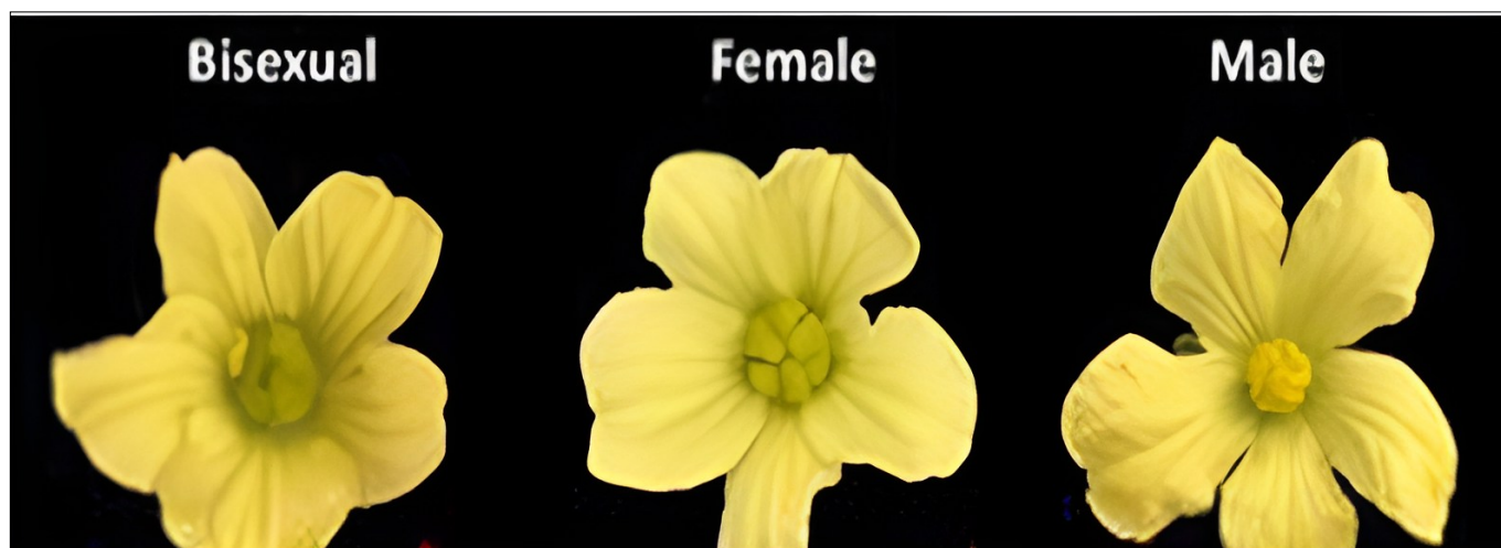
Fig. 1. Three major angiosperm sexual systems in the family of Cucurbitaceae.