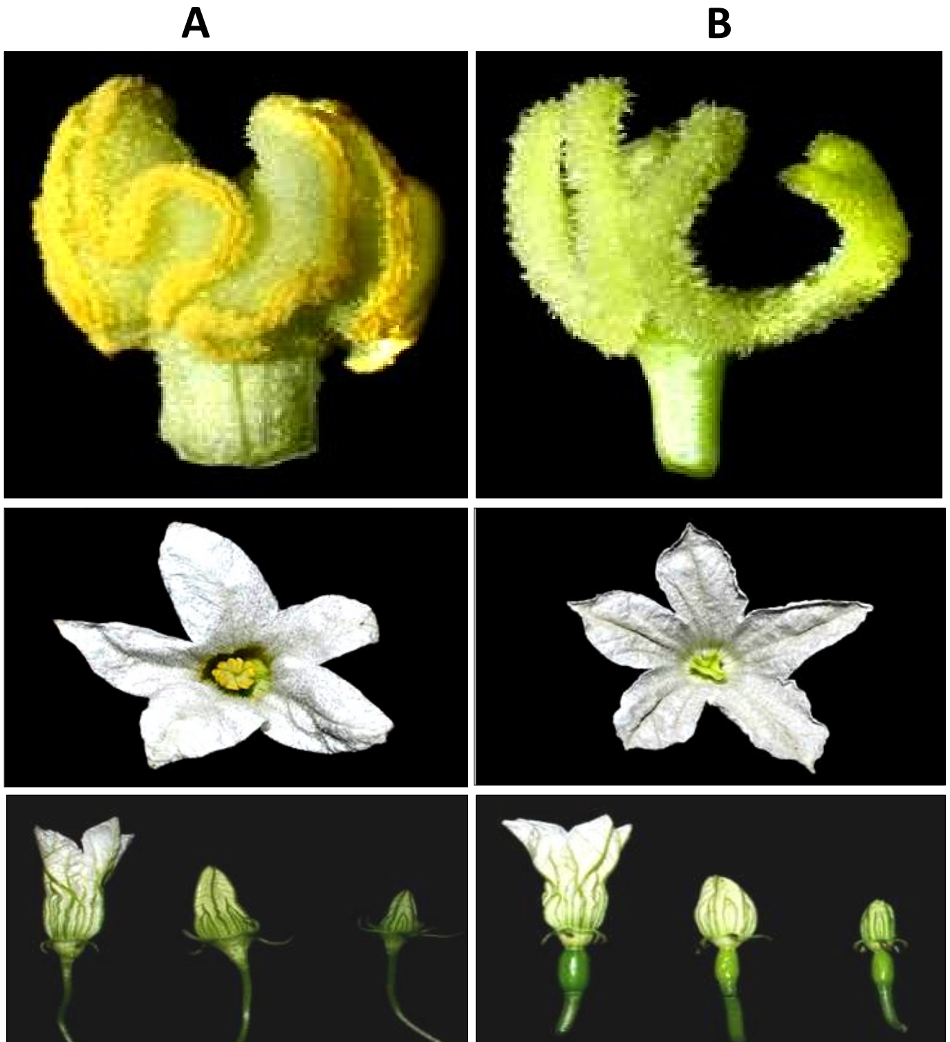
Fig. 2. Sex evolution pattern of dioecious cucurbit: (A) Evolution of male flower from three different budding stages to flower formation with anther, (B) Evolution of female flower from three different budding stages to flower formation with stigma in dioecious cucurbit C. grandis .

while gynodioecy is primarily found in temperate herbs (45), dioecy is more common in tropical woods (24). On the other hand, monoecy is found linked with dioecy traits (5, 25), suggesting that monoecious conditions are more likely to favor the evolution of dioecy than those that promote gynodioecy. Therefore, the evolutionary development of dioecy from hermaphrodite is not bound to follow 2 distinct steps but may instead be a gradual process with multiple steps and pathways (44). For instance, in the case of Sagittaria latifolia , a dioecious species, the progression appears to have occurred from monoecy through gynodioecy (46). In this scenario, male and female flowers are