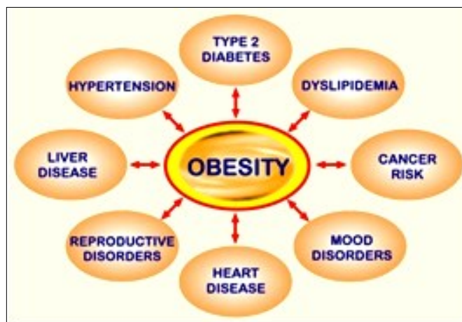
Fig. 1. Effects of obesity on human health (12).

This review aims to elucidate the metabolic consequences of anti-obesity drugs derived from both medicinal plants and pharmaceuticals on human health as well as to evaluate the efficacy and safety of each type.