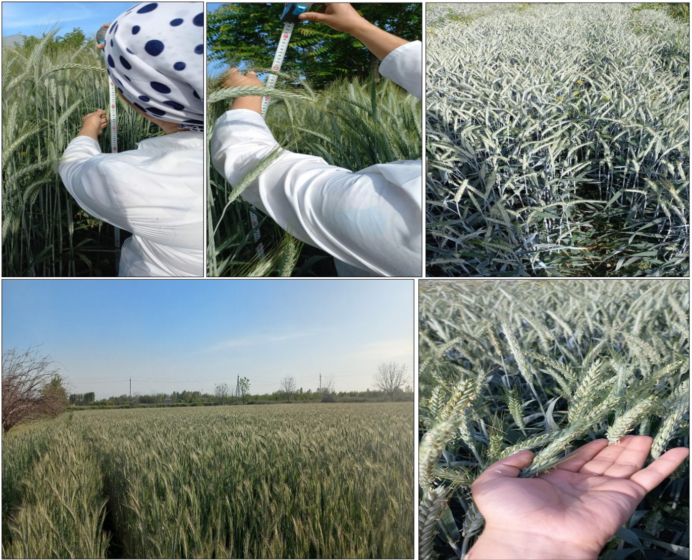
Fig. 1. Scientific research conducted on triticale varieties in the conditions of meadow -gray soil.

precipitation is 312 mm, mainly in winter and spring. However, during these periods, the climatic conditions of each month differ from each other (23). Nowadays, the temperature in such regions is relatively high, as a result of which drought threatens the growth and development of plants. The cultivation of drought- and heat-resistant plants such as triticale in such regions is of great economic necessity, because triticale makes good use of autumn, winter, and spring rainfall in the area (24). Triticale ( \times Triticosecale) varieties with 5 genotypes: "Odessiy", "Tikhon", "Swat", "Valentin", and "Farkhod" were used. The variety "Farkhod" was selected as a control based on previous studies.