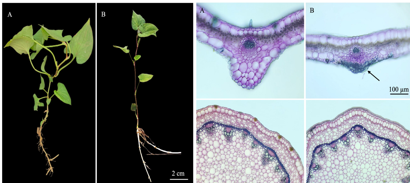
Fig. 2. Morphological characteristics and anatomical structures of leaves and stems of H. cordata were examined in two areas, Tan Thong Hoi (A) and Phu My Hung (B) in Cu Chi, Vietnam. The arrow indicates the region of lignified cells in the lower epidermis of the leaf.

these two locations, with ammonium values ranging around 9-10 mg/kg soil (Table 1). This suggests that the Phu My Hung area is subjected to more pronounced drought conditions compared to Tan Thong Hoi. During drought conditions, crops tend to grow at a slower rate or synthesize substances to adapt to water scarcity. Indeed, the IC50 value measured by the DPPH method reveals that H. cordata in the Phu My Hung area possesses significantly higher antioxidant capacity than those in the Tan Thong Hoi area (Table 2). H. cordata leaves in the dry conditions of Phu My Hung also develop lignified cells in the lower epidermis (Fig. 2). The formation of these cells and the reduction in vascular bundle size and thickness enhance water use efficiency, minimizing water loss due to the water-repellent properties of lignin (10, 11). However, there are no significant differences observed in the anatomical structure of the stem between the two areas.