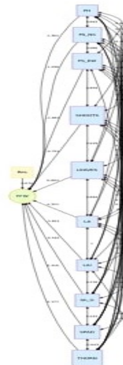
Fig. 2. Path diagram for rose traits.

The D 2 analysis grouped in Table 4 the genotypes into 5 distinct clusters based on their similarities in various characteristics or attributes. Cluster I is comprised of a single genotype, " Rosa rubiginosa var. arka parimala." Cluster II includes " Rosa rubiginosa var. arka pride" and " Rosa rubiginosa var. arka swadesh," which share common characteristics that distinguish them from other genotypes. Cluster III encompasses a diverse set of genotypes, including " Rosa rubiginosa var. arka savi," " Rosa rubiginosa var. arka sinchana," " Rosa rubiginosa -Mirabel Red," " Rosa rugosa - Roman Red," and " Rosa foetida - Roman Yellow," suggesting that these genotypes have some commonalities in their attributes. Cluster IV consists of "Seven Days Rose" and "Scent Pink," implying that they share certain characteristics that set them apart from other genotypes (13). Finally, Cluster V comprises the genotype " Rosa