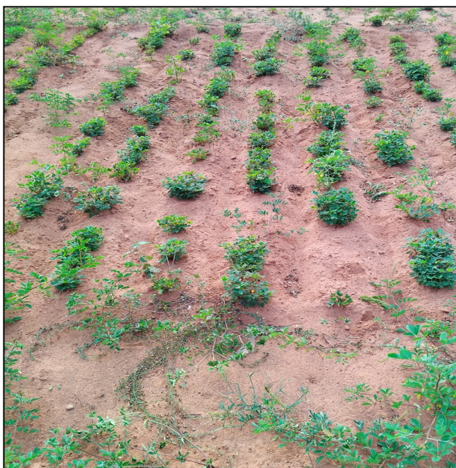
(B) Effective treatment