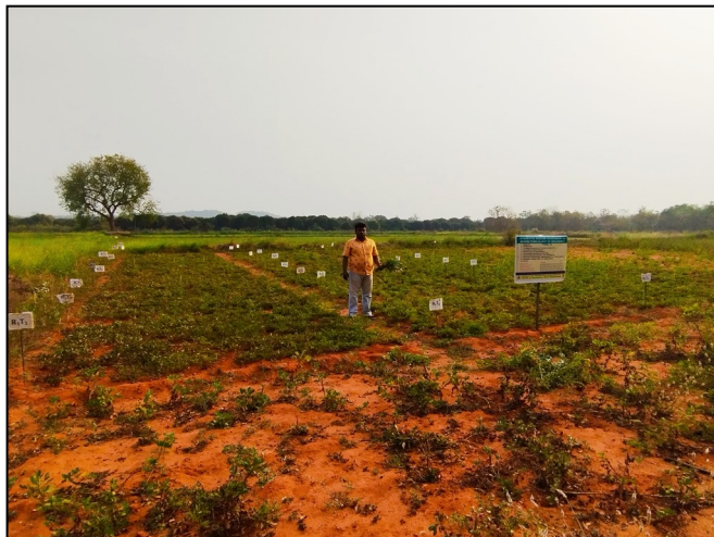
(A) Overview of field photo