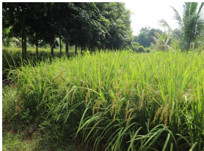
Fig. 3 Rice intercropping under rubber forest

There is significant interest in quantifying the ecosystem services provided by rubber agroforestry systems, including carbon sequestration, water regulation, and soil