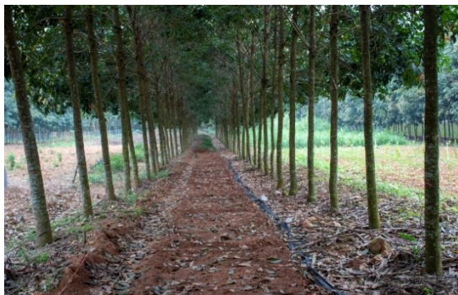
Fig. 5 "Forest-fungus" pattern of rubber plantation

fertility enhancement (46, 47). Different types of production systems have different impacts on the ecosystem, with greater biodiversity in plantations that have greater complexity in habitat structure and agroforestry ecosystems supporting some forest species not found in monocultures. More studies are needed to compare the effects on biodiversity of different spatial organizations, to understand interactions between species ecosystems in complex systems, and to study the effects of plantation management practices (e.g. pest control) on ecosystems.