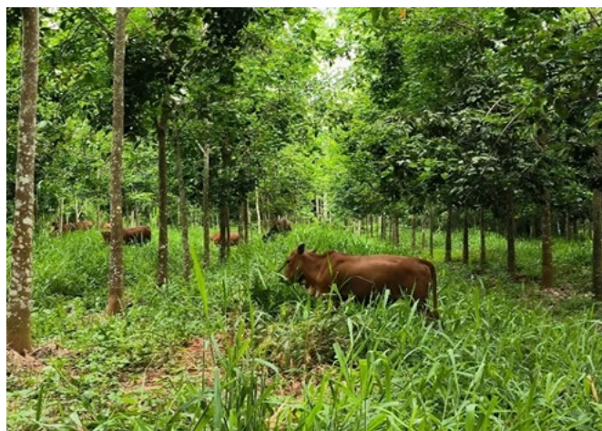
Fig. 4 "Forest-grass-livestock" pattern