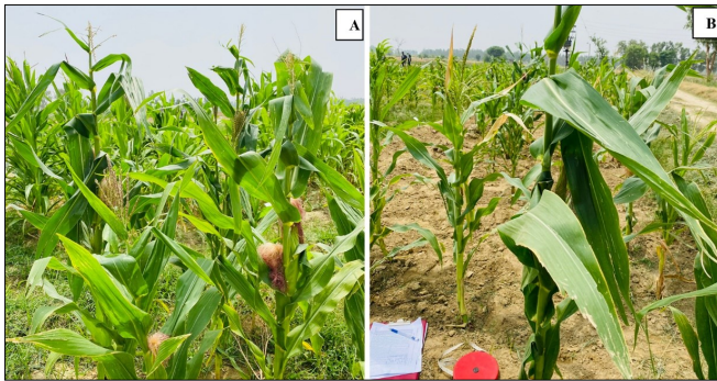
Fig. 2. Maize field full (A) and free (B) of weeds

In the crop-weed system, light plays the role of regulating growth and development and even competition between the two. The plant response varies depending on the amount of light, duration of light, the quantitative spectrum of light and its fluctuations. The amount of light intercepted by weeds is a major determinant of their growth. Manipulating the amount of light intercepted by their canopy can significantly reduce their degree of harm; water stress reduces photosynthesis by interfering with chlorophyll synthesis, electron transport, synthesis and activity of carboxylation enzymes; temperature governs the seasonal growth of weeds and their geographical distribution. For example, at daily and night temperatures of 18°C/12°C and 24°C/12°C, respectively, maize grows faster than any weed and thus stifles its growth (Fig. 2); soil solarisation is also based on high temperatures preventing the germination of weed seeds; the concentration of CO 2 in the atmosphere affects the crop well as the weed, directly or indirectly. C 3 plants generally use more CO 2 than C 4 plants, which has an impact on