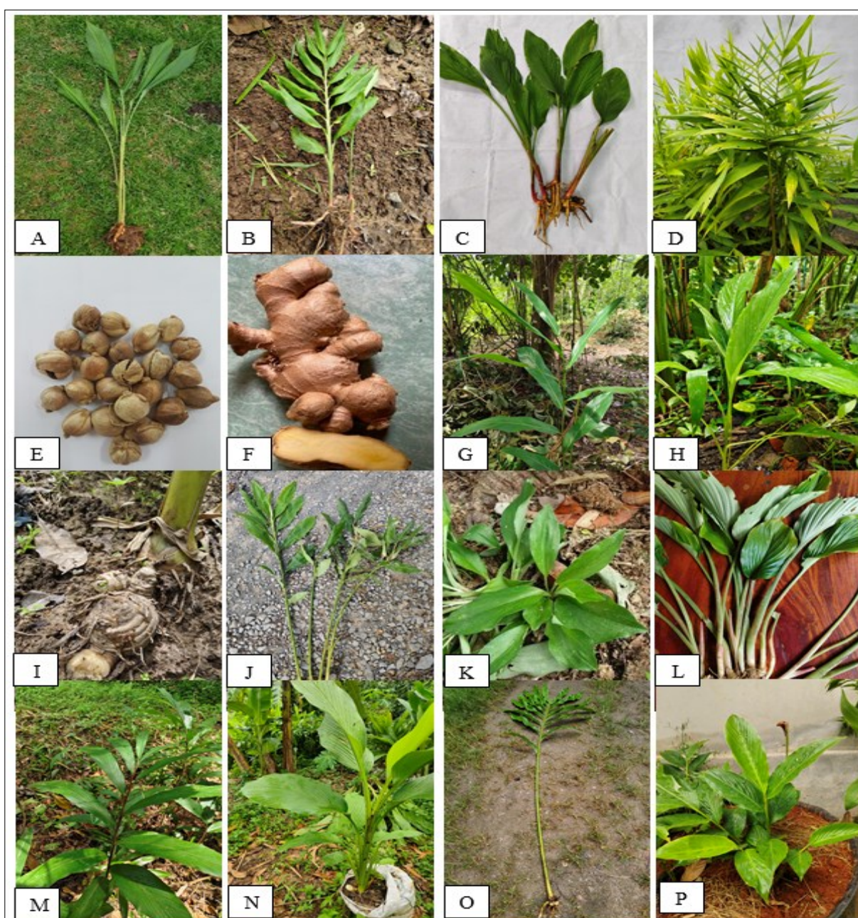
Fig. 2. Zingiberaceae plants: (A) Curcuma longa L. (B) Zingiber ligulatum Roxb. (C) Boesenbergia rotunda (L.) Mansf. (D) Zingiber cassumunar Roxb. (E) Amomum testaceum Ridl. (F) Zingiber officinale Roscoe (G) Alpinia galanga (L.) Willd. (H) Curcuma zedoaria (Christm.) Roscoe (I) Curcuma comosa Roxb. (J) Zingiber zerumbet (L.) Roscoe ex Sm. (K) Kaempferia galanga L. (L) Kaempferia parviflora Wall. Ex Baker (M) Amomum biflorum Jack (N) Curcuma mangga Valetton & Zijp (O) Etlingera coccinea (Blume) S.Sakai & Nagam. (P) Alpinia purpurata (Vieill.) K.Schum.

n is the number of all informants in the study (10).