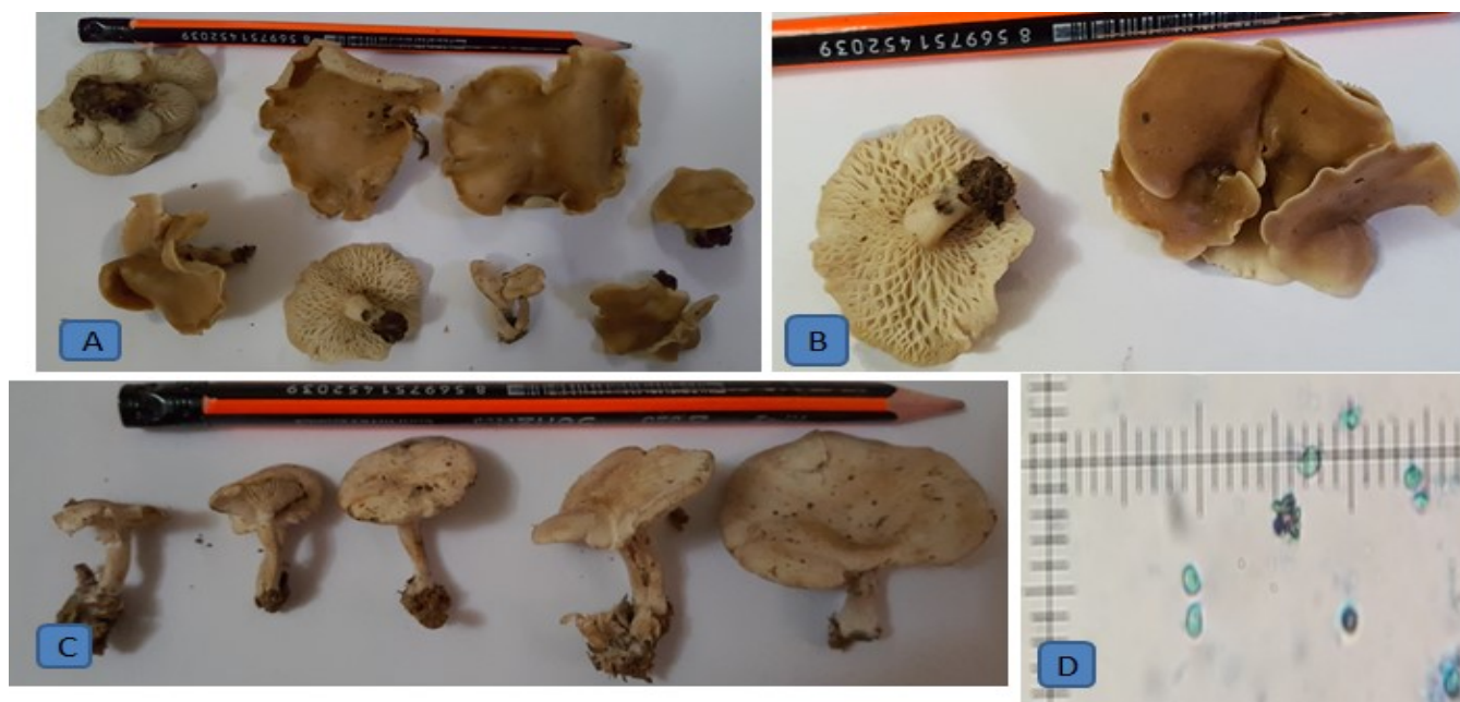
Fig. 4. Ossicaulis salomii : a-c. basidiocarps, d. basidiospores. (40x).

(40,43-44). Based on morphological techniques, the introduced species of this genus share various standard features except O. salomii , making it difficult to distinguish the seven species as reported by previous studies (42-44). Thus, these species have been alienated based on the phenotypic and molecular phylogenetic results.