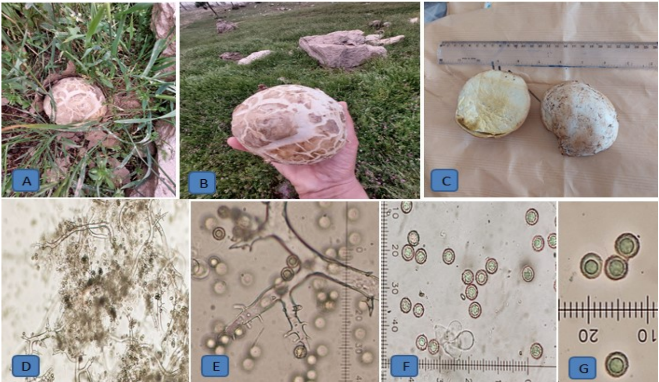
Fig.3. Mycenastrum corium : a. basidiocarps, b-c capillitium. d-e basidiospores.(40x)

(BPP=1). The present species was independently parted from another genus, Calvatia and Disciseda , related to Agaricaceae and Asterophora, linked to Lyophyllaceae with high Bayesian posterior probabilities (BPP=1). The current results confirmed the ability of ITS sequences to reliably identify and phylogenetically separate this species, similar to previous results (20). The sequencing of the ITS region has been considered a suitable tool for species-level identification since the establishment of various databases dedicated to identifying ITS and other ribosomal sequences over the past 30 years (23). Besides, this region is substantially and constantly used as the official DNA barcoding marker for species identification of fungi (3,23). Thus, the conserved ITS region imparts substantial data for molecular phylogenetic studies as being applied in other genera (2,23).